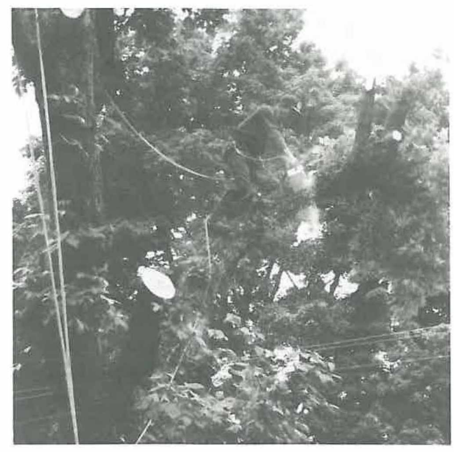
Figure 1. Tree trimmers at risk of falls and electrocutions.