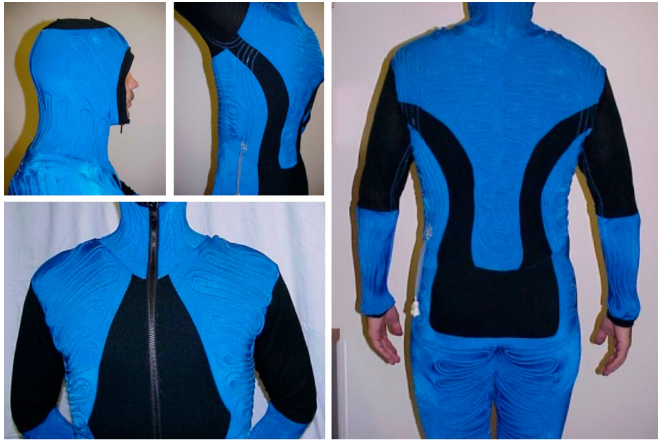
Figure 2. Subject wearing the liquid cooling garment (LCG) used in the study. Note: Several different views presented. The LCG is designed to cover areas of the body with high heat exchange capacity. The full color version of this figure is available online.