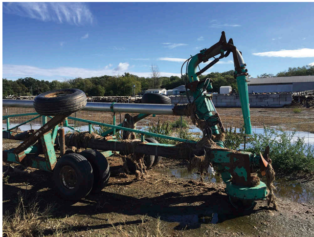
Figure 2. Agitator unit after the incident.

settles down inside of the liquid slurry. This agitator had a large spray gun that remained approximately 6 inches above the top surface. A large tractor's (235 horse power engine) power takeoff operating at 540 rpm served as the agitator's power unit. Agitation action was accomplished via the large propeller at the end of the agitator structure, along with an aggressive 6-inch pump that lifted and sprayed liquid waste outward and to the sides and above the surface of the liquid to help break up crusted surfaces. The agitation and pumping were controlled with levers that actuate hydraulic valves on the agitator unit. Those controls were mounted on the front of the agitator and accessed from ground level. Figures 2 and 3 show the agitator structure and controls, with the agitator having been pulled out of the storage basin after the