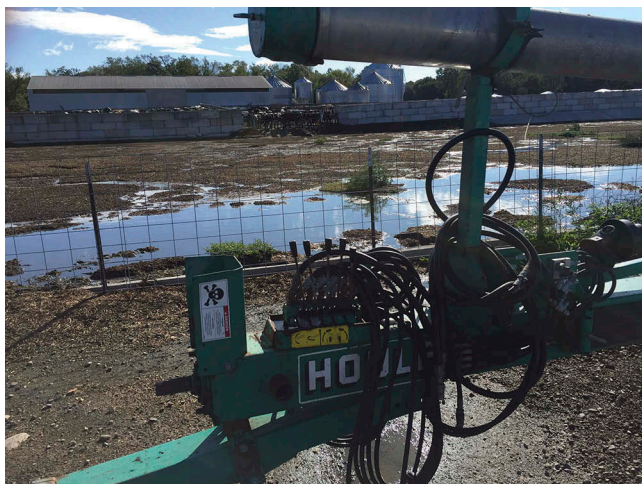
Figure 3. Agitator controls.