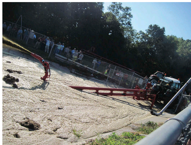
Figure 4. Manure agitation in process at educational field day.

incident. Figure 4 shows an example of a typical agitation process occurring during an educational field day. Manure pumping and spreading contractors often depend on the agitation to be started prior to their arrival, which allows the contractor's crew to begin hauling immediately.