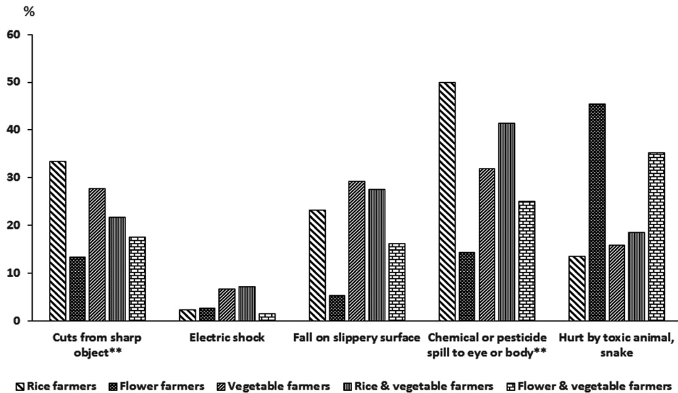
Figure 2. Accidents in the past 3 months by farm type (**significant differences at P < 0.05 ).

face (74%), and rubber gloves (55%). Less than half reported wearing cotton gloves (34%), a balaclava (39%), a disposable paper mask (35%), or goggles (17%). There were significant differences in personal protective equipment (PPE) use while spraying insecticides by farm type. For the use of rubber and cotton gloves, the highest frequency of use was reported by flower and flower/vegetable farmers compared with vegetable farmers, who reported using the least (Fig. 3).