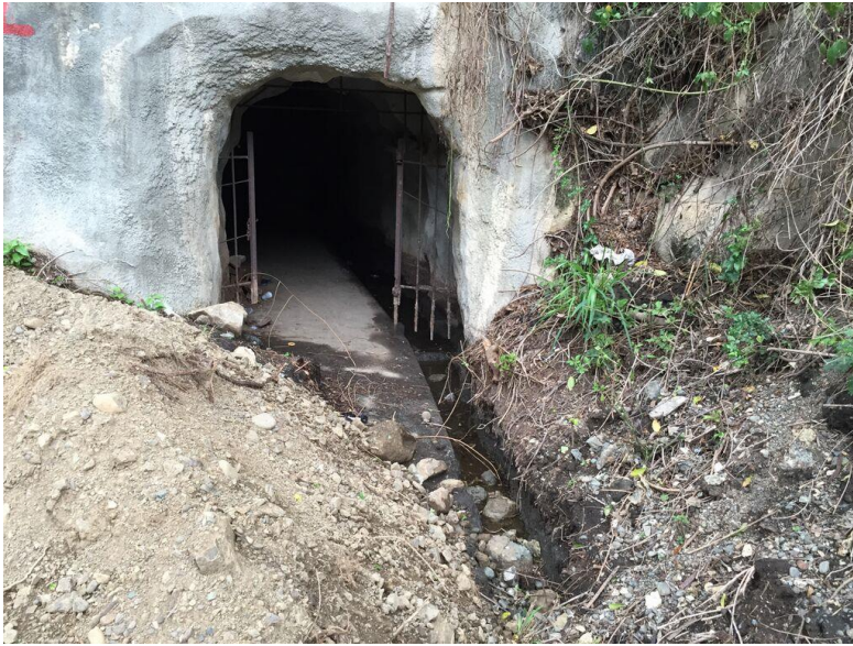
Figure 1. Entrance to a tunnel associated with severe histoplasmosis outbreak, Dominican Republic