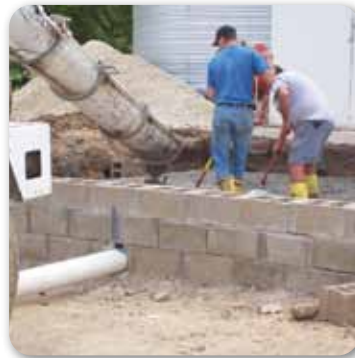
Work practices that can lead to sensitization and irritation