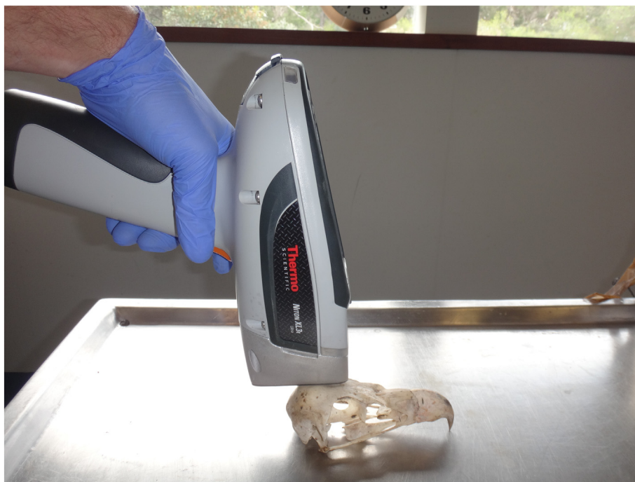
Fig. 1. Methods used to measure bone lead concentrations via X-ray fluorescence (XRF) in bare skulls of wedge-tailed eagles ( Aquila audax audax ) from mainland Australia.

measurements. An optimized setting of 50 kV, 40 \mu A, and filter combination of silver and iron were selected for bone lead measurements as per previous studies (Specht et al., 2019b; Specht et al., 2018b). The device was not calibrated using lead-doped bone phantoms as per previous work (Specht et al., 2019b; Specht et al., 2018b) due to the unavailability of these products in Australia at the time, but instead the device was calibrated against the known ICP-MS measures for the Tasmanian wedge-tailed eagle femur fragments in order to determine lead concentrations in the eagle skulls. Each sample was analysed using a 3-min (180 s) read. Only one measurement was performed per sample.