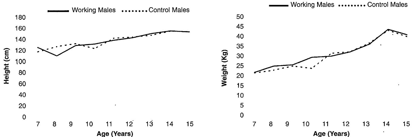
Figure 2—Height and Weight (Male Children)

Physical examination findings. Heights and weights of working children and control-group children did not differ systematically, as shown in Figures 2 (boys) and 3 (girls). Table 3 shows the prevalence of physical examination findings of working and control-group children and the associated ORs. The prevalence of palpable lymph nodes; abnormality on abdominal palpation, such as enlarged liver or spleen, or abdominal tenderness; and visual abnormalities did not differ significantly between working and control-group children (p > 0.05 for each). Signs of tonsillitis were significantly more common among the control-group children (p < 0.001). For the