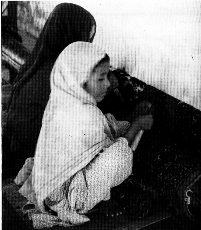
Figure 1— Carpet weaving children at working site

the law is not applicable in homes, the use of child labor is rampant among poor families in rural areas as it provides a needed source of income.