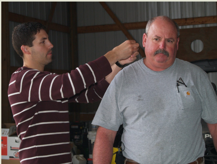
Approximately 46% of intervention and 44% of control participants had moderate or profound hearing loss in at least one ear at the onset of the Point Source Hearing Protection Strategy study.

Our preliminary findings show that there is a need to educate farmers on the proper use and disposal of HPDs, hazards associated with noise, importance of noise control and use of HPDs. Interviews with farmers reveal a strong interest in protecting their hearing. Younger participants observed the hearing difficulties of their fathers and grandfathers and appeared motivated to use hearing protection. Participants acknowledged that having hearing protectors close to loud noise sources would give them the access to these protective devices when they are most needed.