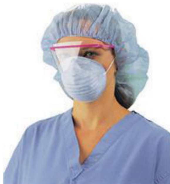
Figure 1. Half face piece face shield with eyewear-like temple bars.

with face shield wear. [9, 11] Visors can be treated with advanced coatings to impart anti-glare, anti-static, and anti-fogging properties, ultraviolet light (UV) protection, and scratch resistance features to extend the life of the visor. [11] Some models come with built-in goggles that are incorporated into the visor. [9, 10] Visors are available in different lengths that include half facepiece length extending to the mid-face, full facepiece length that extends to the bottom of the chin, and a face/neck length that also covers the anterior neck area (Figures 1 and 2). Most visors curve around the face and come in different widths; wider visors offer more peripheral protection. [9] Some one-piece face shields have visors that conform to the wearer's face upon donning (Figure 3). [10] Recommendations from the Centers for Disease Control and Prevention (CDC) are for visors that are of sufficient width to reach at least the point of the ear, [12] as this will lessen the chances of the likelihood that a splash could go around the edge of the face shield and reach the eyes. In addition, visors should have crown and chin protection for improved infection control purposes. [7, 13] Some models of disposable medical/surgical face masks are available with an integral, thin plastic visor fitted to the top of