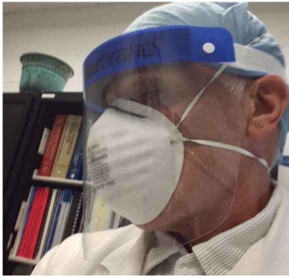
Figure 3. Disposable one-piece face/neck length face shield visor assembly with foam forehead cushion and elastic strap.

of the face shield visor. Some models also incorporate a brow cap (Figure 2) into the frame that affords additional splash protection in the forehead region, as well as allowing for more visor distance from the face that better accommodates the wearing of additional PPE (e.g., goggles, loupes, prescription eyewear, respirators) (Figure 2). Disposable visor-only face shields are also available that have a forehead foam cushion that provides a comfortable seal to the forehead (Figure 3).b)