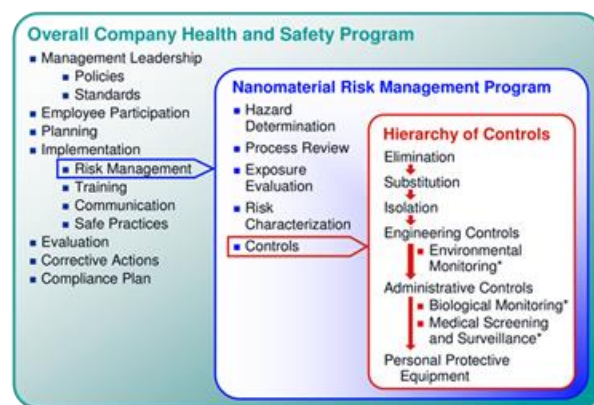
Figure 2. Components of an overall health and safety program that includes nanomaterial risk management.

A systems approach to management encourages the view of an organization as a whole including an inventory of the workforce and material resources available; this way, substructures and subsystems may be organized and resources may be allocated to them in the most efficient and effective way. An effective management systems approach is invaluable to the safe commercialization of engineered nanomaterials through a PtD-enabled approach (Figure 2) [1]. An effective management system begins with an executive position statement which details all activities from bench-top to production to distribution and use. In the conceptual planning stages of a product, process, or facility that incorporates engineered nanomaterials, the executive position statement can be used to align goals in the integration of worker health and safety into each step. This step-by-step approach refines the decision-making process and enables the rational discovery of occupational hazards for elimination from the design process.