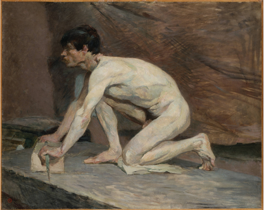
Marble Polisher: Princeton University Art Museum. Gift of the Forbes Magazine Collection: Malcolm S. Forbes, Class of 1941, Malcolm S. Forbes Jr., Class of 1970, and Christopher Forbes, Class of 1972. 1882-7m. Original oil on canvas, 65.5 x 81.3 cm. Used with permission.