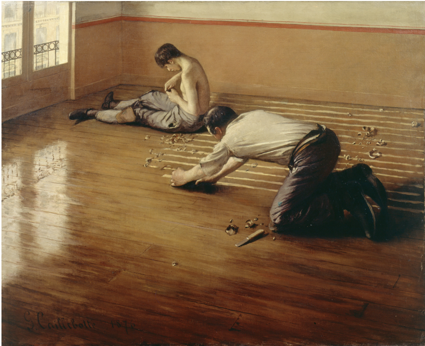
Floor scrapers: Caillebotte “Etude pour les Raboteurs de parquet.” Private collection - courtesy Comité Caillebotte, Paris. 1876. Oil on canvas, 80 x 100 cm. Used with permission.