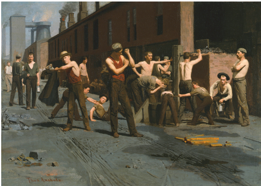
Ironworkers in factory yard: Thomas Pollock Anshutz, American, 1851-1912 The Ironworkers' Noontime , 1880 Oil on canvas, 17 x 23 7/8 in. (43.2 x 60.6 cm). The Fine Arts Museums of San Francisco, gift of Mr. and Mrs. John D. Rockefeller 3rd, 1979.7.4.