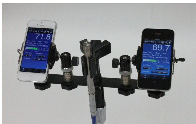
Fig. 1. (Color online) The SoundMeter app on the iPhone 5 (left) and iPhone 4S (right) compared to \frac{1}{2} -in. Larson-Davis 2559 random incidence type 1 microphone (center).

To analyze the data, we generated a randomization sampling schedule and employed analysis of variance using both SAS (Cary, NC) and Stata software (College Station, TX). We used the difference between the actual sound level (as measured by the reference microphone) and the app measurement (the outcome variable), and then determined the effects of noise level, device, and app on this outcome. A difference equal to zero would indicate perfect agreement between the app measurement and the actual value. The larger the difference the poorer would be the agreement between the app and the reference microphone.