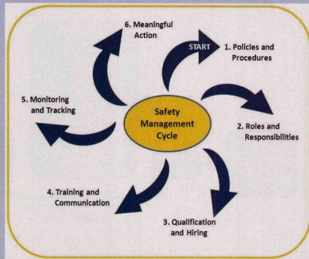
Figure 2 Safety Management Cycle

Note. From "CSA—Compliance, Safety, Accountability: What Is the Safety Management Cycle?" by FMCSA. Retrieved from http://csa.fmcsa.dot.gov/about/smc_overview.aspx .