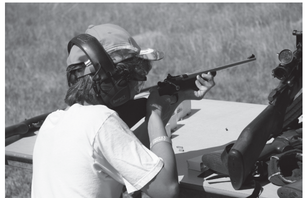
Figure 1. Example of youth target shooting position; sitting at table and wearing electronic earmuffs.

Impulse recordings were made outdoors using a 1/8-inch prepolarized pressure microphone (G.R.A.S. Type 40DD) with an approximate sensitivity of 1 mV/Pa, and oriented at grazing incidence to the sound source. This microphone affords a useable frequency range up to 140 kHz and a dynamic range extending to 186 dB peak SPL. The microphone was equipped with 1/4-inch preamplifier (G.R.A.S. Type 26AC) capable of carrying the potentially large signals without overload or slew-rate limitations. Microphones were calibrated using a pistonphone (G.R.A.S. 42 AP) before and