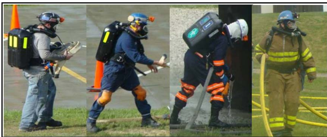
FIGURE 5. Example of different types mine rescue ensembles used in the U.S.

Furthermore, through meetings, field observations, and a literature review, it was found that the type of hazards, environmental conditions, the type and the level of the activities and protection needs of wild land fire fighters and technical rescuers (utility and