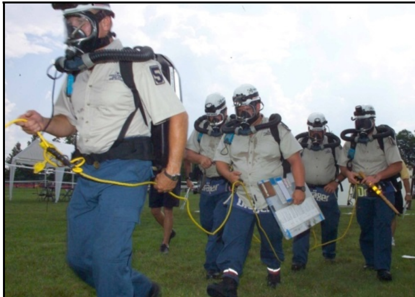
FIGURE 3. Mine rescue team members.