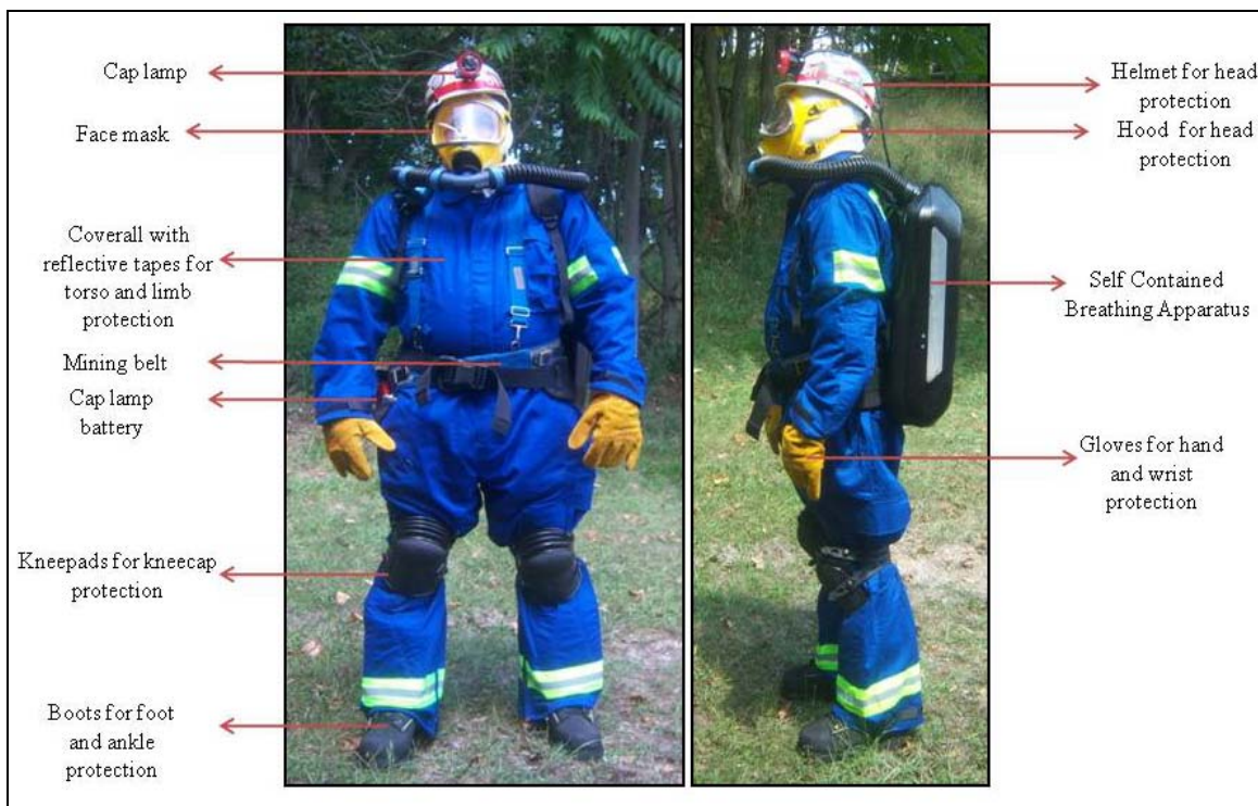
FIGURE 4. Elements of a typical mine rescue ensemble.