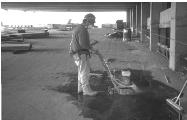
FIGURE 4 The scabblers in use with the control in place. Note the spray bar and the valve on the handle.

Review of the video exposure monitoring from the initial sampling showed that peak exposures were associated with (1) repeatedly going over the same area, aerosolizing dust that had been produced