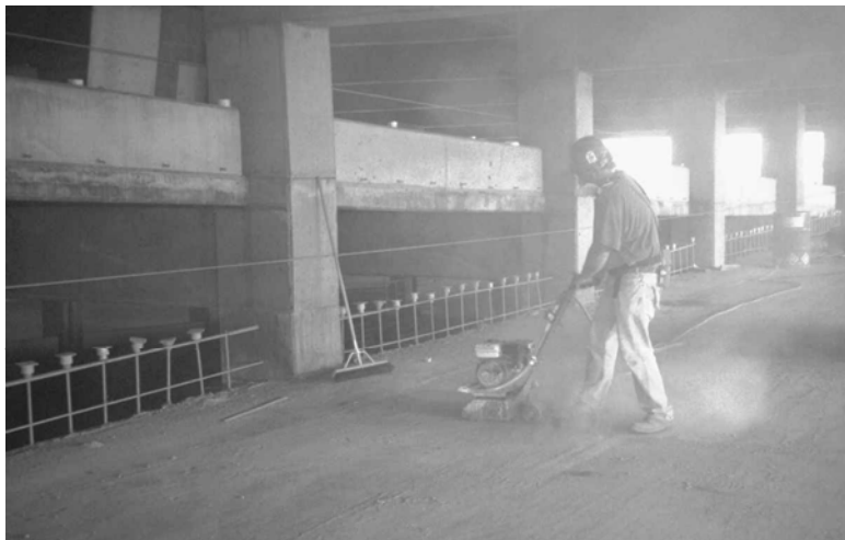
FIGURE 1 The scabbler in use without the control.

Crystalline silica analysis was done using X-ray diffraction. NIOSH Method 7500 was used with the following modifications: (1) filters were dissolved in tetrahydrofuran rather than being ashed in a furnace; and (2) standards and samples were run concurrently, and an external calibration curve was prepared from the integrated intensities rather than using the suggested normalization procedure. These samples were analyzed for two forms of crystalline silica—quartz