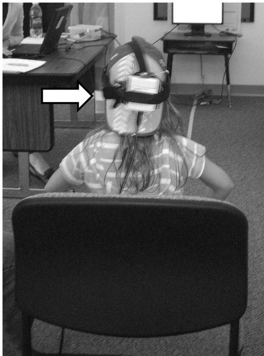
Figure 1 Rate sensor attached to headband and hat for monitoring rate of head movement

Next we collected the subjects' static and dynamic visual acuity scores. For SVA, the head was kept stationary. For DVA, the subject actively moved his or her head to the left and right, but we were able to uniquely flash an optotype for rotations to one side only, enabling us to determine a DVA score for left and right rotations. Five optotypes per size were presented. Static testing trials began at 20/80 and continued through to identify the smallest size for which all 5 optotypes were correctly identified (minimal size to accurately identify all optotypes at a size) and the smallest size for which at least 3 of 5 optotypes were correctly identified (the minimal size to accurately identify the majority of optotypes at a size). The trial stopped automatically when these criteria were met. Dynamic testing was performed similarly, except the trial started at 3 sizes above the static acuity level. Additionally, all children completed training trials as described previously 21 to assure proper head movement; testing proceeded when 80% success was achieved in training. During dynamic testing, the optotypes appeared only if the head moved >180° per second (monitored by a rate sensor on a headband; figure 1). All subjects were encouraged to guess even if they were not confident (i.e., forced-guess paradigm). Retesting was completed on