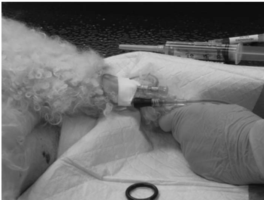
FIGURE 2. Intravenous administration procedure for doxorubicin.