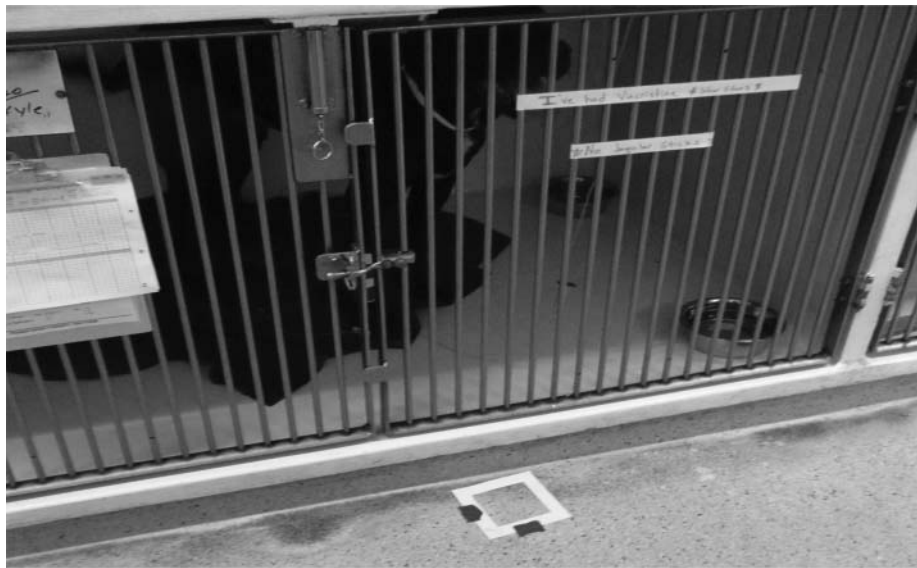
FIGURE 3. A chemotherapy drug-treated canine in a labeled kennel. The label warns employees of potential chemotherapy drug cross contamination and identifies the chemotherapy drug used.

After treatment, animals were removed from the table and kenneled in the administration area or in cages or runs in adjacent areas (Figure 3). Employees then decontaminated the treatment table and surrounding floor with a bleach solution. The IV tubing, bag, and other potentially contaminated items were placed in chemotherapy-approved disposal containers, and the area was wiped with a 10% bleach solution and allowed to dry.