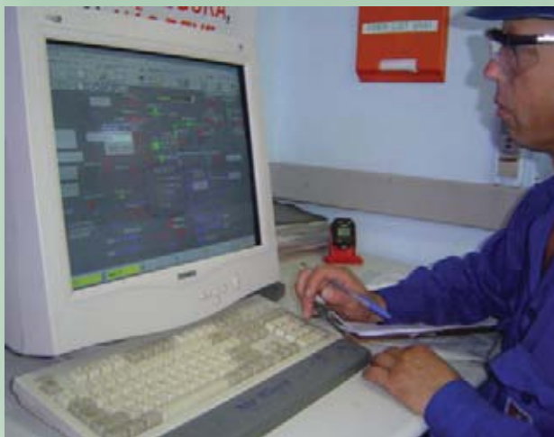
(From top): Use of PTD methods to replace open-system transfer of hazardous raw materials in small quantities (Photo 1) with automated closed-system transfers (Photos 2 and 3).