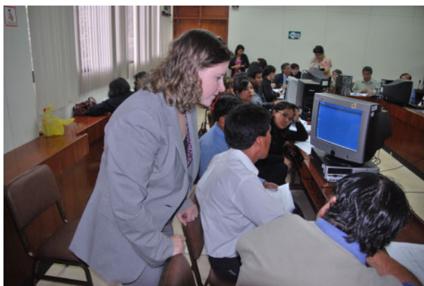
Figure 3 Control banding workshop at the 3rd International Summit for the Elimination of Silicosis, in Lima, Peru, 2010.

country. Representatives from the ministries, regional directors, and labor inspectors participated so they could train other health and safety professionals within their designated regions (Fig. 3). In collaboration with the Chilean ISP, the Peruvian Ministry of Health plans to include a control banding approach to silica exposure control in legislation.