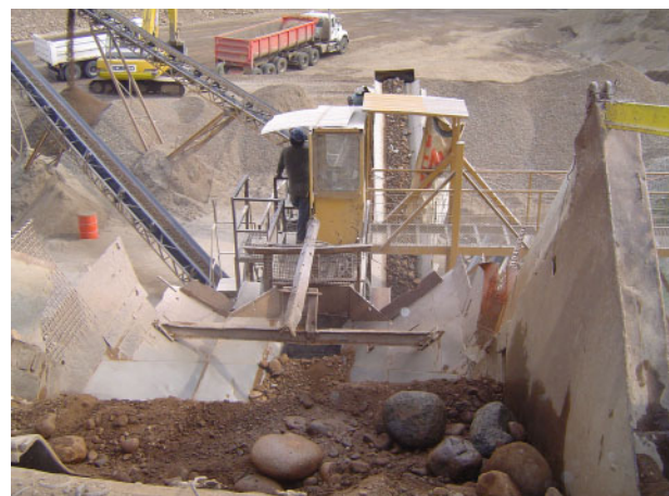
Figure 2 Stone crushing in Santiago, Chile, 2007.

In 2008, a five-member research team from NIOSH visited Peru’s National Institute of Health to present a technical course on silica and heavy metals, emphasizing laboratory analyses, sampling, quality assurance, evaluation of interventions, and control banding. Later in 2010, during the third Latin American Summit for the Elimination of Silicosis, the ministries hosted a half-day workshop on establishing a control banding approach for industries throughout the