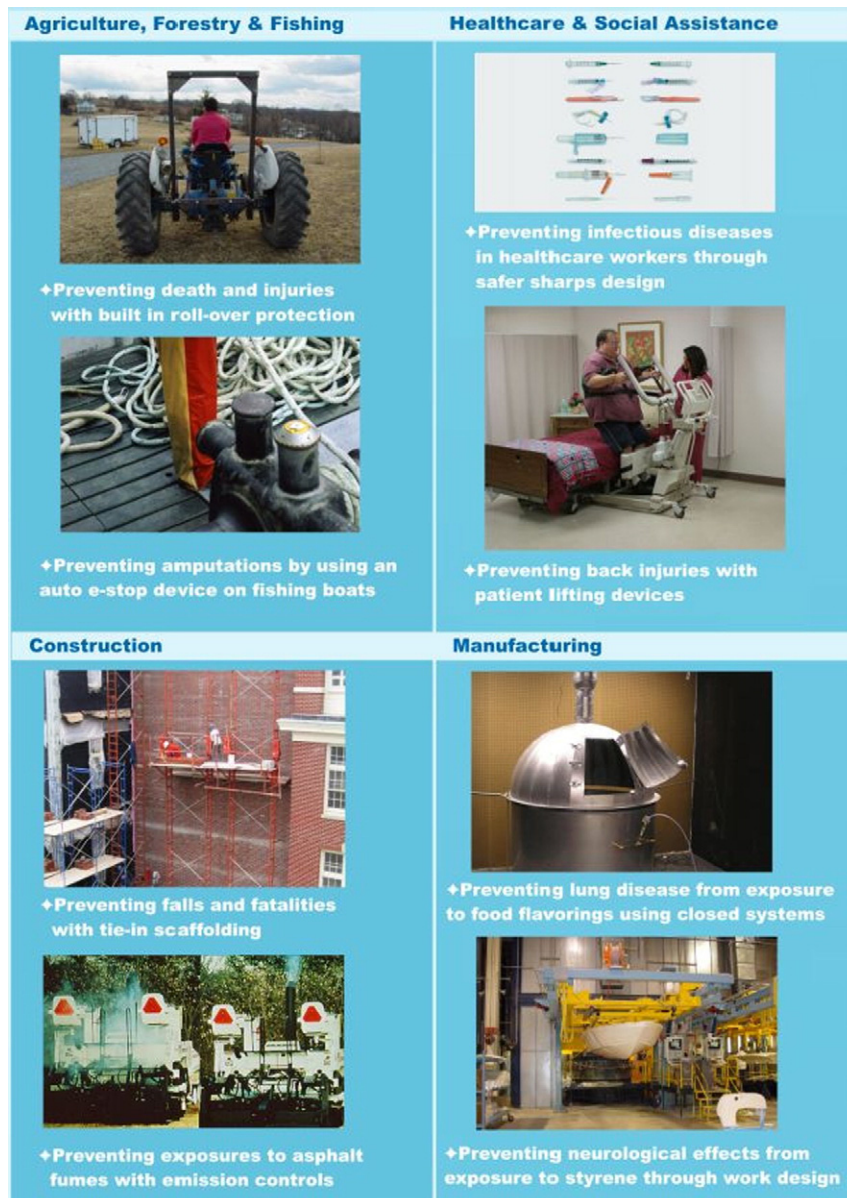
Fig. 2. Examples of Prevention through Design (PtD) in each sector.

The PtD National Initiative will be framed within four functional areas: research, practice, education and policy. Research focuses on a broad range of questions pertaining to design effectiveness, linkage of designs to morbidity and mortality, metrics for assessing designs,