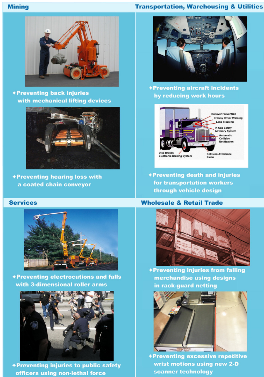
Fig. 2 (continued).