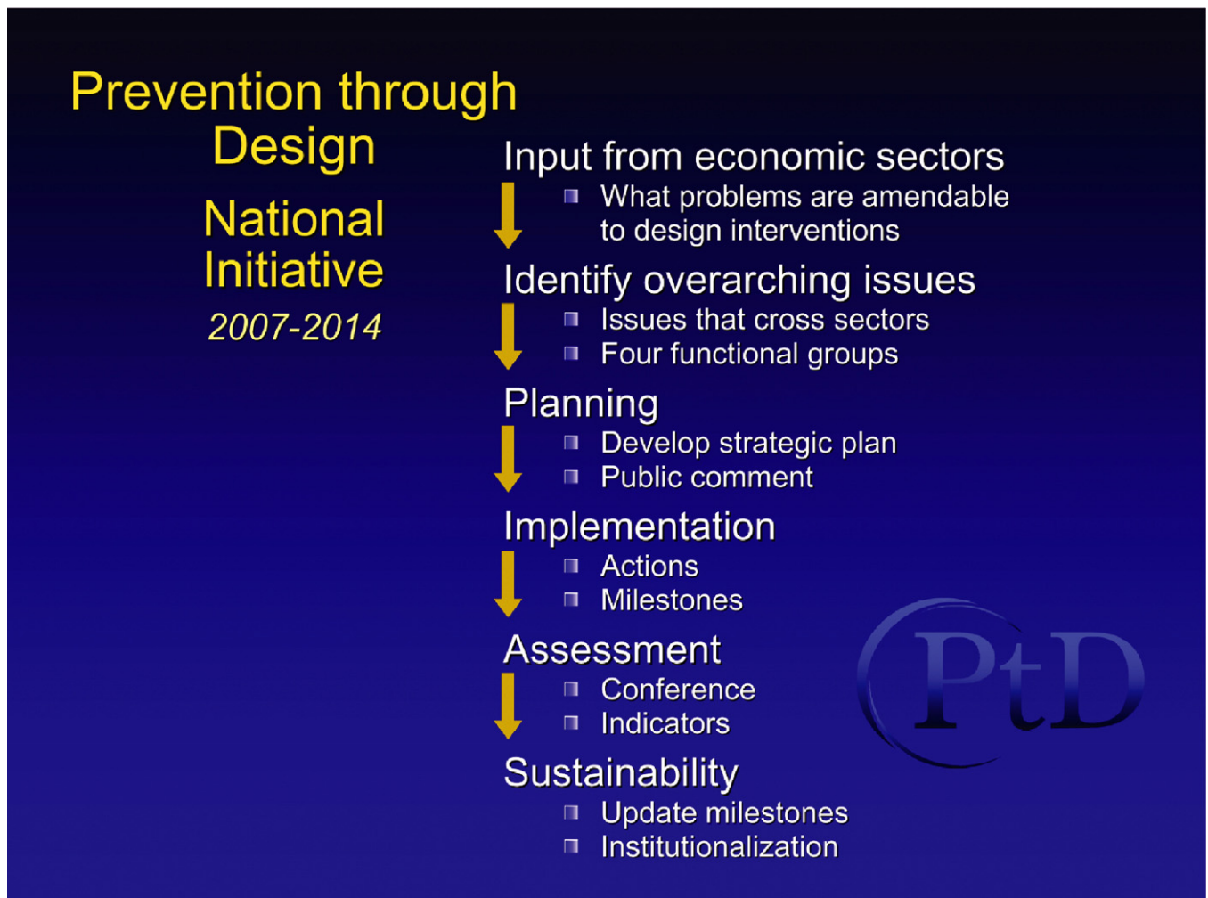
Fig. 3. Main elements of the PtD Initiative.