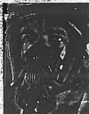
MSA Pressure-demand Air-Line Respirator

A: Employers must provide all required respirators, training and medical evaluations. (See News , on page 4, for OSHA's latest ruling on this issue.)