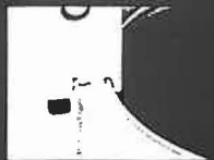
CLEANS THE RIM