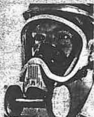
MSA Full facepiece, Twin cartridge

Disclaimer: Mention of commercial products or trade names does not constitute endorsement by the Centers for Disease Control and Prevention or the National Institute for Occupational Safety and Health. The findings and conclusions in this report are those of the authors and do not necessarily represent the views of the National Institute for Occupational Safety and Health.