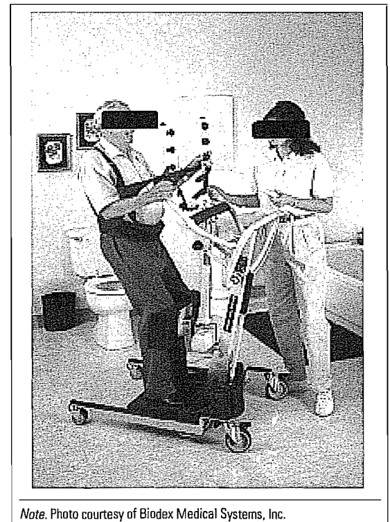
Figure 2. Example of a Sit-to-Stand Device

and what the risk levels are for work-related MSDs for those tasks.