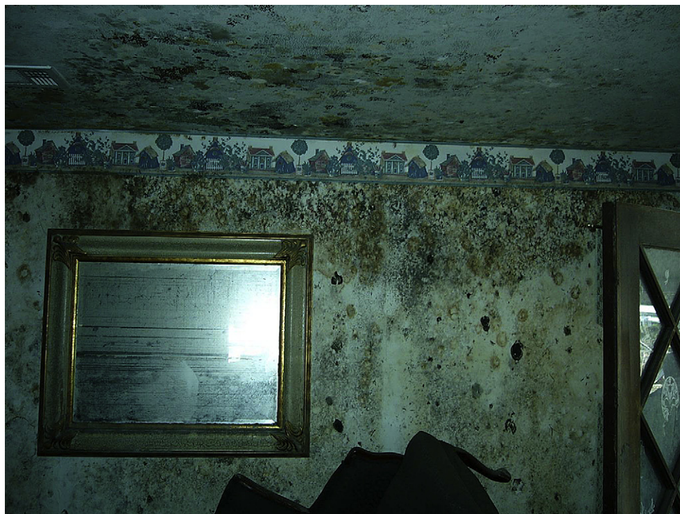
Fig. 4 – Mould damage to walls and ceiling in a domestic dwelling affected by Hurricane Katrina.