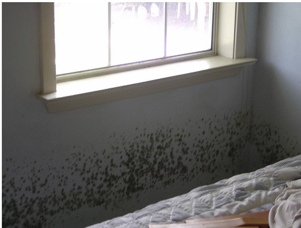
Fig. 1 – Mould damage in a domestic dwelling affected by Hurricane Katrina.

(LRS). The most commonly reported symptoms were nasal symptoms (URS) and cough (LRS). Three hundred fifteen respondents reported using either a mask or respirator during clean-up. In October 2005, the CDC Mold Work Group