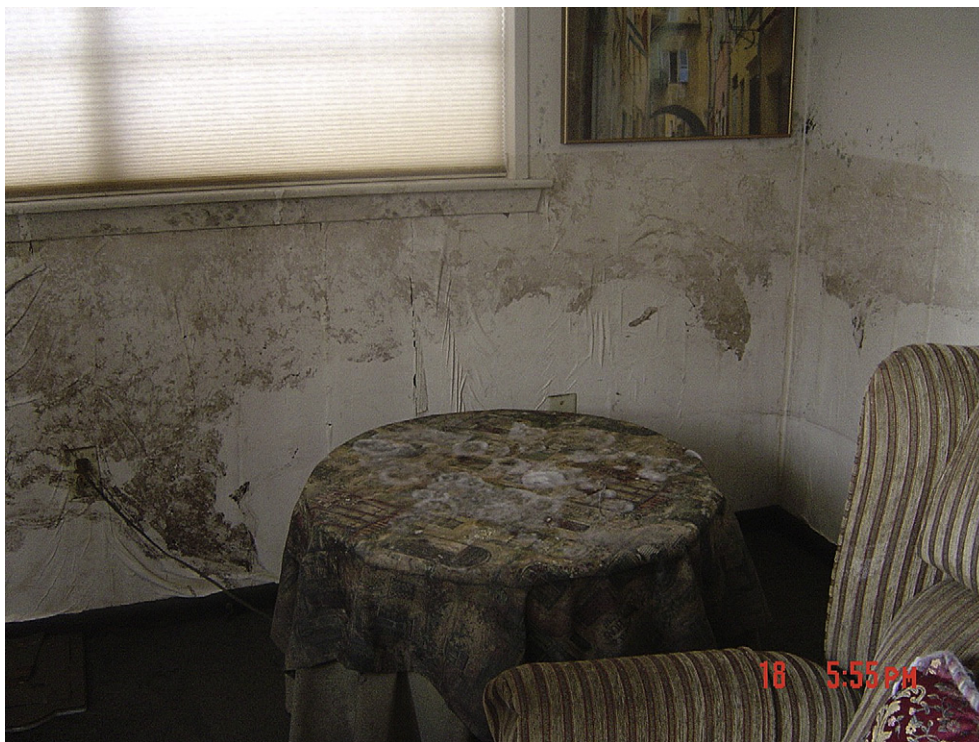
Fig. 3 – Mould damage in a domestic living room affected by Hurricane Katrina.