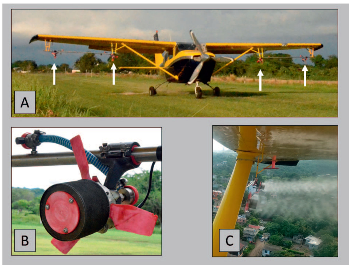
Fig. 3. (A) Aircraft employed in the trials with arrows indicating the 4 nozzles, (B) the rotary atomizer mounted under a wing, and (C) the aerial view at the time of application.