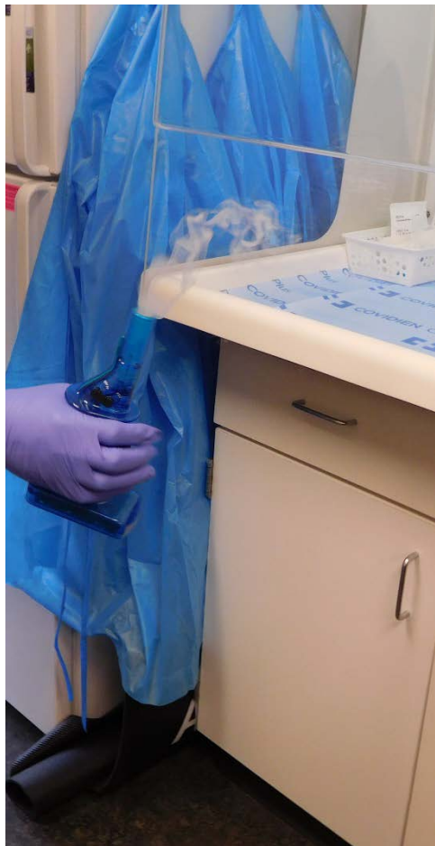
Figure 5. Qualitative smoke test with Wizard Stick Smoke Generator