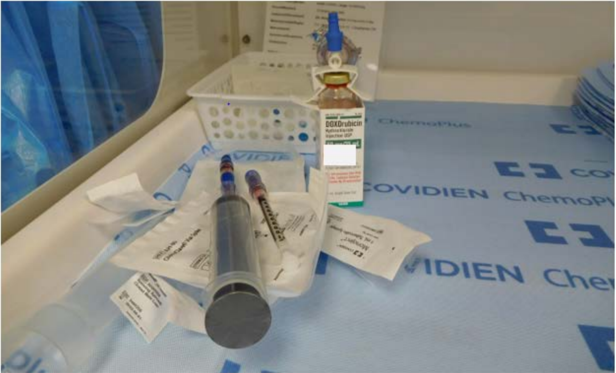
Figure 7. Intentional "Hot" wipe sample collected from doxorubicin syringe with vial with CSTD adapters.