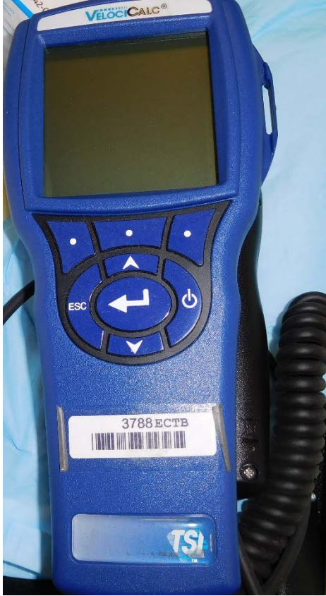
Figure 4. TSI® VelociCalc™ Plus Model 9565-P thermal anemometer