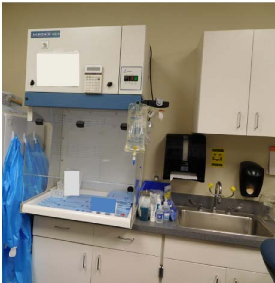
Figure 2. Ductless fume hood, Misonex Aura 30L Series Model AU-30L. Also shown: disposable gowns, sink, and toceranib bottle in white bin.