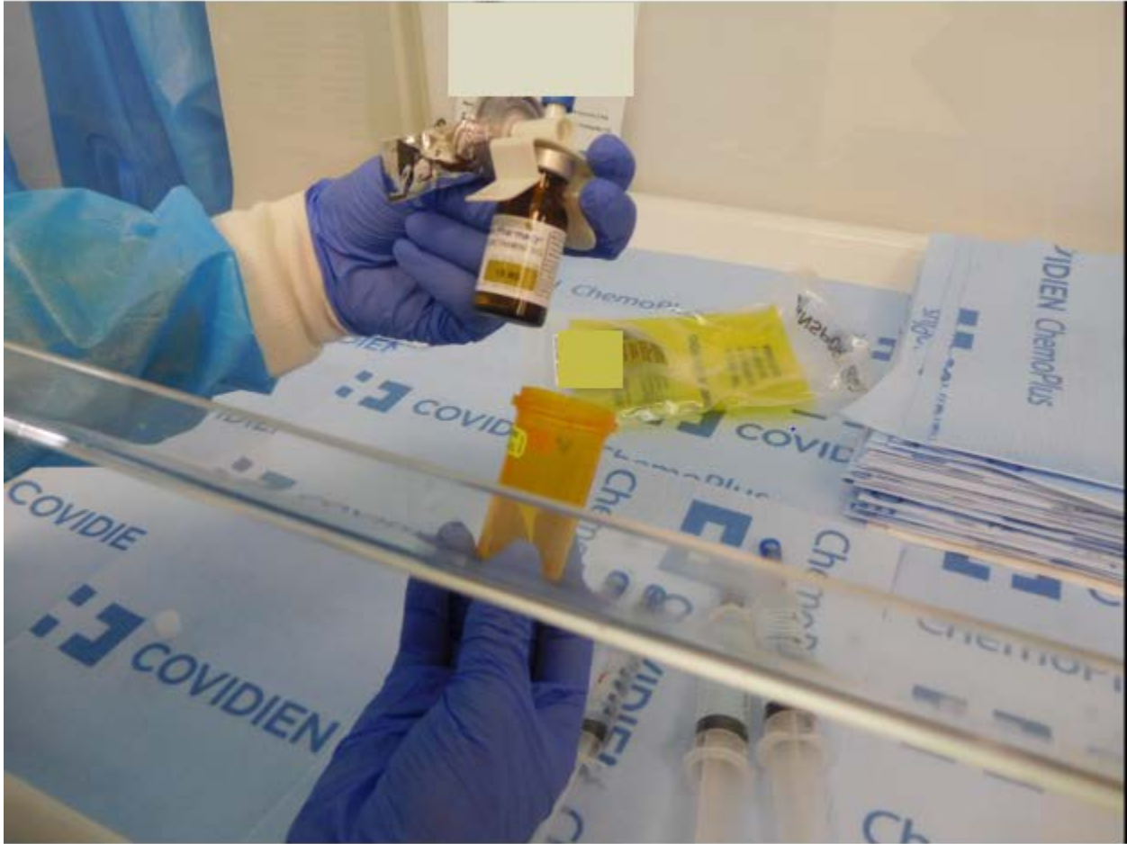
Figure 12. Intentional "Hot" wipe sample collected from mustargen vial