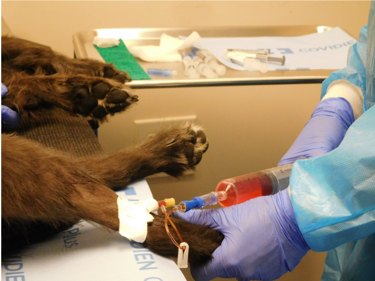
Figure 3. ICU Medical CSTD system with syringe adapter and y-site adapter shown