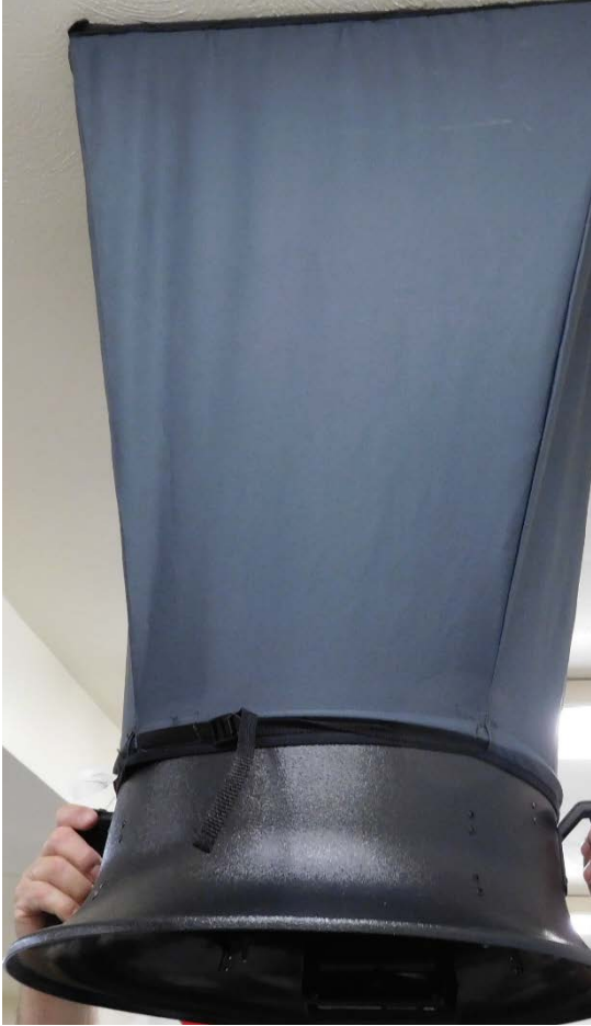
Figure 6. TSI Accubalance ® Plus Air Capture Hood