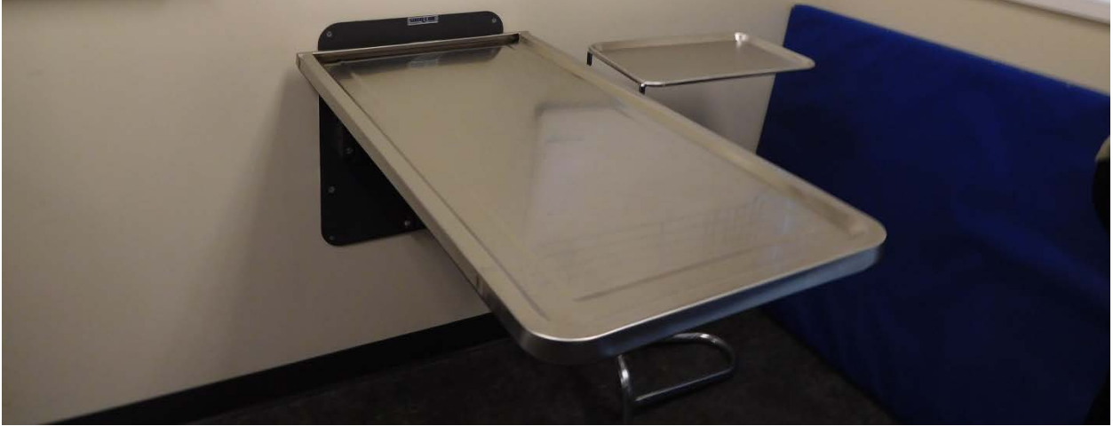
Figure 8. Examination table with tray