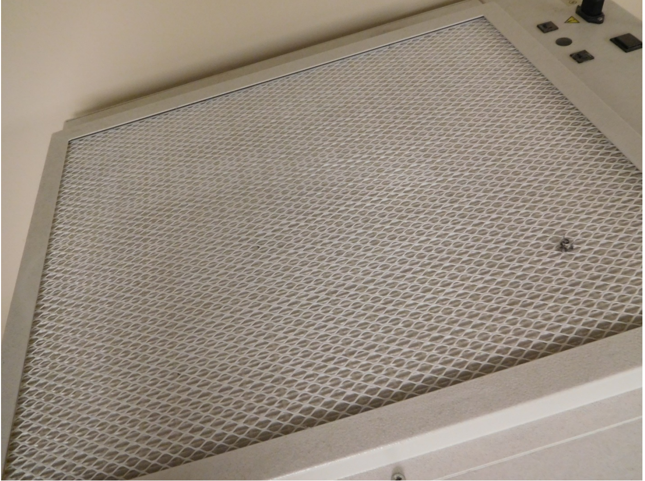
Figure 11. BSC exhaust