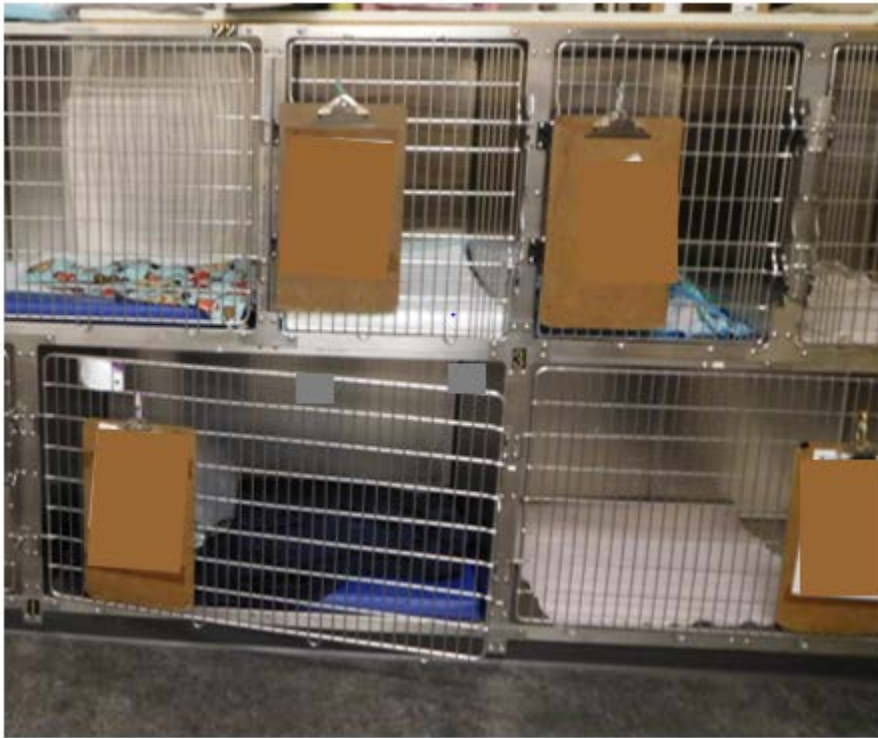
Figure 1. Kennels