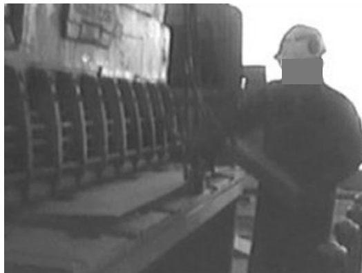
Figure 7. Shear Operator Placing Steel Plate on Shear