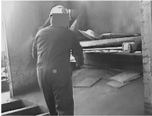
Figure 8. Shear Operator Hooking Small Cut Pieces