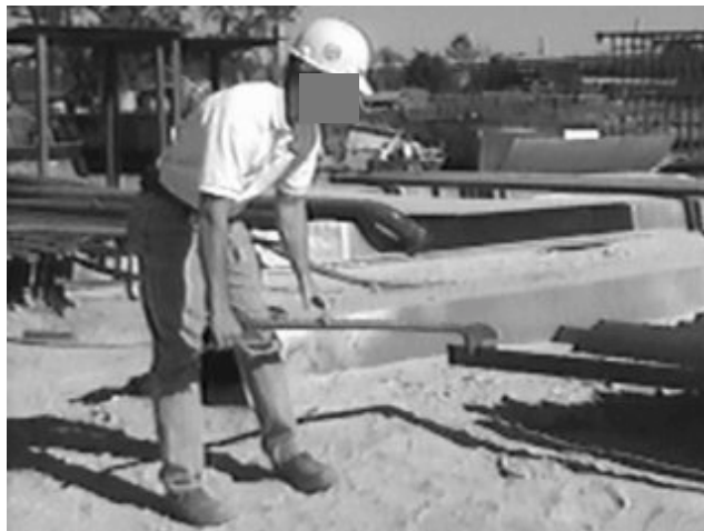
Figure 5. Gator Bar Worker Flipping Angle Iron from Side with Gator Bar