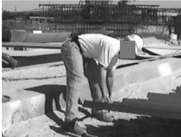
Figure 6. Gator Bar Worker Flipping Angle Iron from End with Gator Bar

Angle irons are adjusted into place by the gator bar worker using their hands or gator pry bar to grip the angle irons.