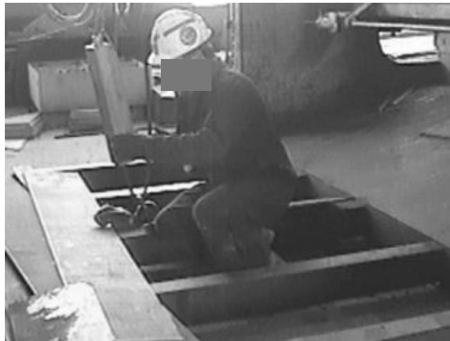
Figure 10. Shear Operator Using Jib Crane to Lift Cut Plate