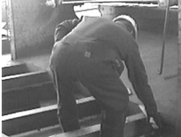
Figure 9. Shear Operator Lifting Pieces at Back of Shear