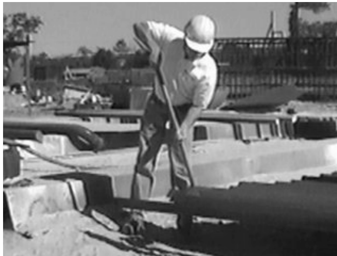
Figure 3. Gator Bar Worker in Steelyard