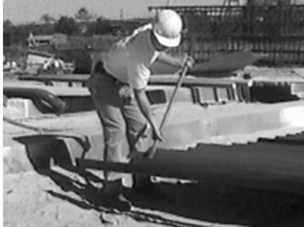
Figure 4. Gator Bar Worker Positioning Angle Iron