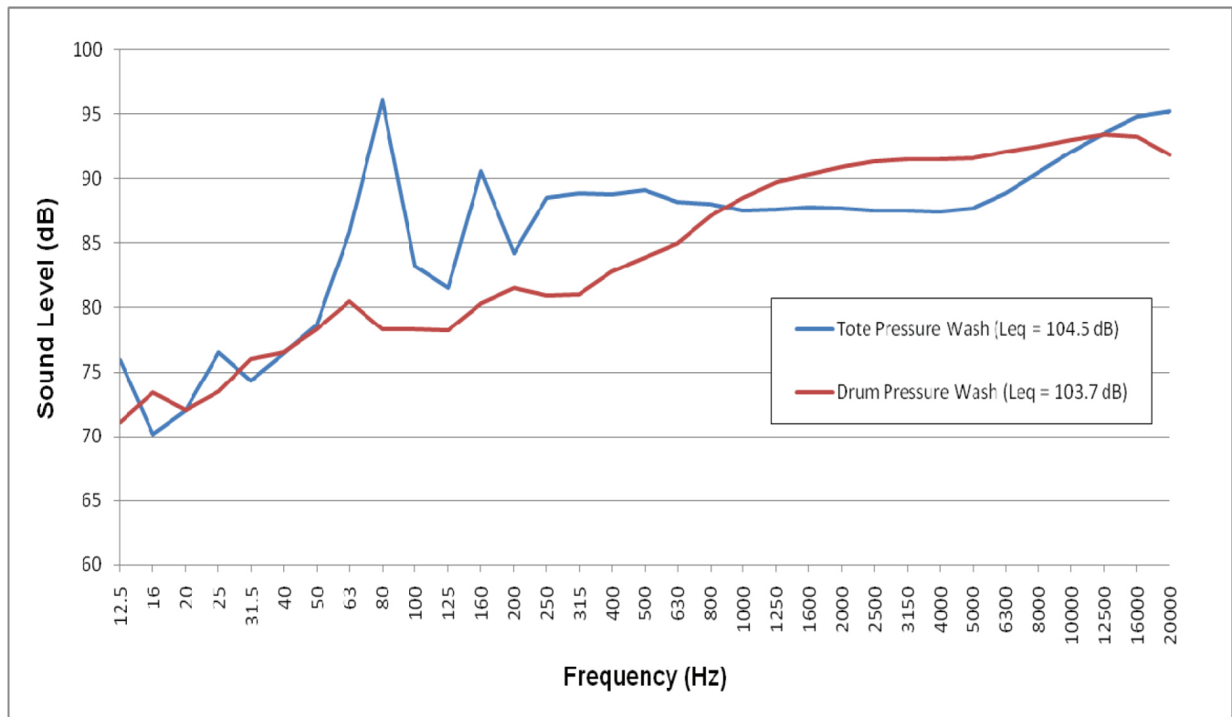
Figure 4. Octave band analysis for the tote pressure wash and drum pressure wash.

Half-mask N95 filtering facepiece respirators (model 8210, 3M, St. Paul, Minnesota) were available to employees for voluntary use. However, we observed employees who were improperly wearing and maintaining these respirators. Some employees believed that these respirators protected them against vapors and gases, but these respirators are only effective against particles.