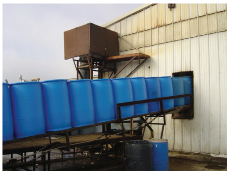
Figure 1. Plastic drums entering the drum refurbishing plant on a conveyor belt.