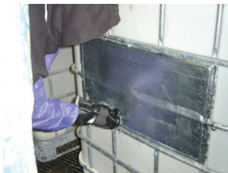
Figure 2. Employee using sponge containing Aromatic 100 to remove adhesive from the plaque of the tote.