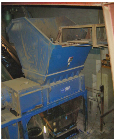
Figure 3. Grinder used for recycling plastic drums.

Washington) to remove residual markings. Aromatic 100 is a liquid that contains petroleum hydrocarbons, trimethyl benzene, xylene, and cumene. If needed, an employee touched up the drums with latex paint (ACE, Matteson, IL) using a pressurized spray gun inside a partially enclosed cross-draft ventilation booth. The paint contained 1,2-propylene glycol. The drums were stored nearby until they could be loaded onto trucks for shipping to customers.