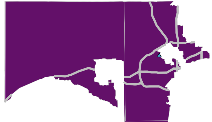
Stroke Death Rate | Texas 82 per 100,000 persons