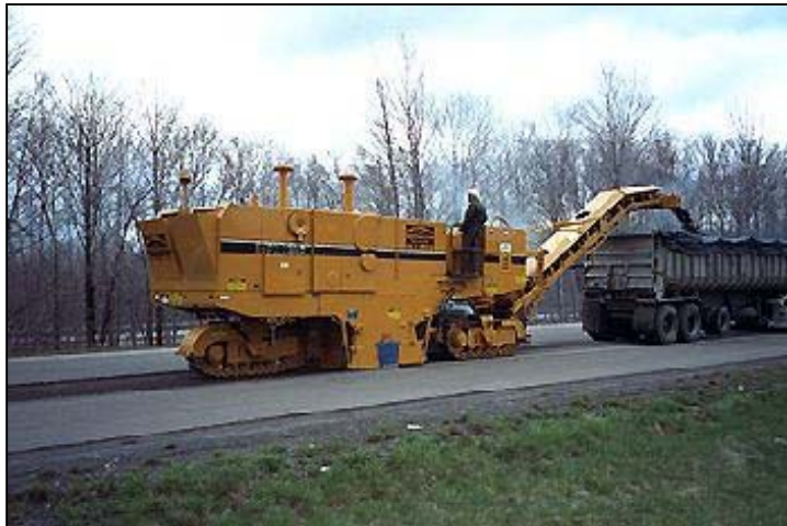
Photo 1 Manufacturer's photo of machine in use

To operate the milling machine, the operator stood at a control station located toward the front of the machine, about six feet off the ground. The design of the control station provided the operator with easy physical access to either side of the machine. The machine was positioned with the two front tracks forward, and a dump truck was positioned under the built-in conveyor to collect the milled