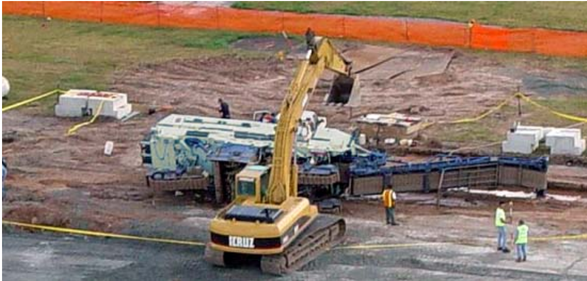
Photo 2 Photo of incident site showing excavator lifting machine

were small mounds of concrete debris in the area. As the machine backed over one of these mounds, the difference between the lower and higher tracks exceeded the machine's slope design limitations. The operator said that he felt the machine "kick" and start to tip, and tried to level out the machine by adjusting the track height. The foreman/groundsman yelled for him to