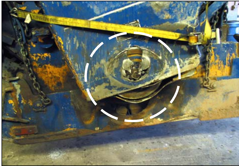
Photo 3 Damage caused by rotating drum bearing cutting through machine's sheet metal during tip-over