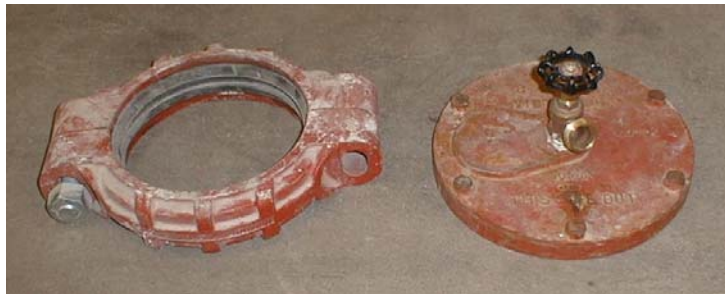
Figure 3 Coupling (left) and retrofitted grooved cap

The victim would have been the person to depressurize them. As the pipefitter loosened the bolts on the coupling in front of him in preparation for removing the end cap, the 5-pound, 6-inch diameter cap exploded from the end of the pipe. It struck him in the face with sufficient force to push him over the rail of the scissors lift. He fell 14 feet to the concrete floor below onto his head. When his co-worker heard the noise, he turned to look,