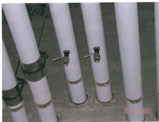
Figure 2 Closed Pressure Relief Valves

On Tuesday, October 29, 2002, at approximately 3:00 p.m., a 49 year-old journeyman pipefitter and his co-worker were standing side by side on a scissors lift preparing to remove 6-inch Victualic grooved end caps