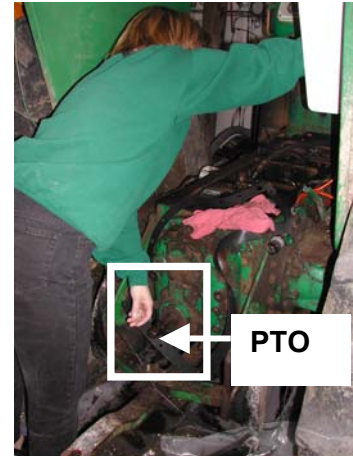
Figure 6- Reaching for PTO lever