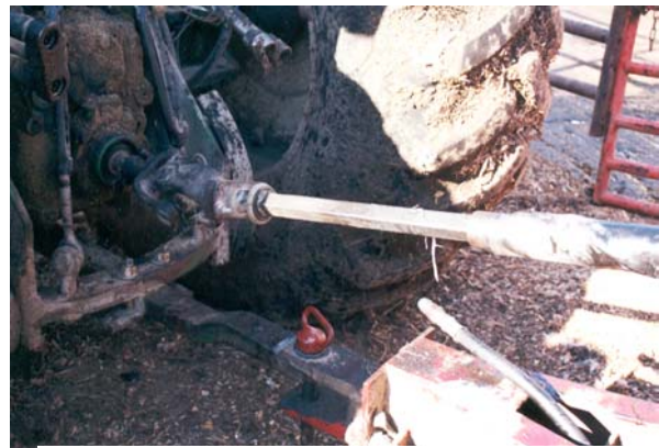
Figure 1 – Unguarded PTO Shaft