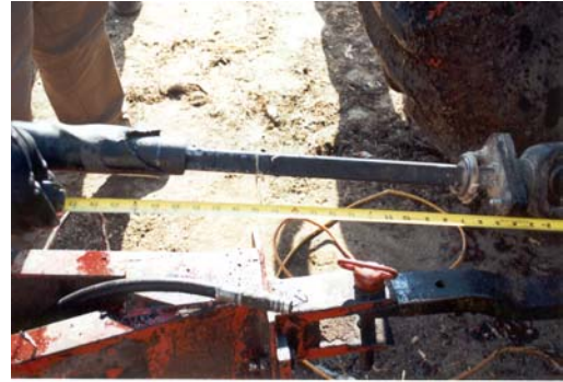
Figure 4 – Unguarded PTO shaft

PTO shielding. The police report of this incident indicated that the alternate PTO shaft was 50 inches in total length. The PTO drive shaft closest to the tractor to 20 inches back to the feed mixer was not shielded (See Figure 4). The mixer's universal joint that connected to the drive shaft housing was also not covered with a protective housing.