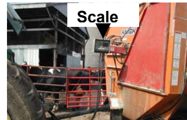
Figure 7 – Scale moved into position