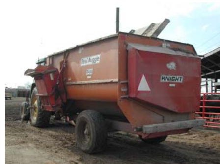
Figure 2 – Knight Brand of Auger-Mixer Wagon

The Knight brand of Auger-Mixer wagon used by the farm operation was a Reel Auggie 3450 tow type feed mixer. It was purchased new in 1996 and was used to mix feed for the dairy cows (See Figure 2). All safety decals were present and readable on the mixer. The mixer had 2 hatches that could be opened to load the mixer from the top with feed. The top of the mixer on the auger side (low side) was 7'3". The top of the mixer reel side (high side) 8'6". The mixer is equipped with a scale mounted on a stationary arm. The scale is capable of pivoting side-to-side to measure feed weights (See Figure 3). The scale is approximately 6 feet off of the ground. The operator's manual stated that when loading hay, it is helpful to have the PTO engaged and the mixer knives running during the loading procedure when hay is added to the mixer. The manual also recommends that the hay be loaded on the auger side (the low side of the mixer) to facilitate mixing of the hay. When loading hay, the manual also recommends that the mixer should be running at least at \frac{2}{3} to \frac{3}{4} rated speed.