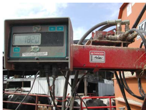
Figure 3 – Mixer Scale

The normal mixer loading procedure was to first add feed supplements at another location on the farm site. To add the feed supplements, the mixer is backed up to the unloading chute at the supplement building with the auger side next to the building. The scale is directed to the auger side (the scale face is in the same direction as the low side of the mixer and faces the supplement building) to determine the supplement weight entering the mixer. After loading the supplements, the tractor and mixer is driven to the bunker silo area on the farm, to continue loading the mixer. Traveling from the supplement location, the tractor would normally enter the bunker silo area from the south; the tractor/mixer faces north. Positioning the tractor/mixer so it faces north places the reel side (high side) of the mixer toward the feeding/milking area and the auger side (low side) of the mixer (with visible scale face) toward the bunkers to allow for easier loading of corn/hay into the auger side of the mixer. The tractor would also be oriented so the operator, if standing on the ground, would not have to reach across the PTO drive shaft to "push" the PTO lever forward to engage the PTO. As told to the MIFACE researchers, the owner said that the operator, if necessary, while standing on the ground would reach around the tractor fender to engage the PTO.