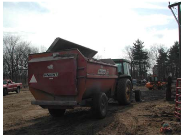
Figure 5 – Tractor/mixer facing south instead of north

On the day of the incident, the victim drove the tractor so it entered the bunker area from the north instead of his usual approach, which is from the south. The farm owner stated that other employees said that they had seen the victim enter the bunker area from the north prior to this incident as a “change of pace”. This positioning of the tractor/mixer had several work practice implications: (1) the auger side of the mixer and the scale face were directed to the feeding/milking area rather than facing the bunker silos, (2) the scale face would need repositioning in order to be seen from the bunker silo side, (3) if standing on the ground, access to the PTO lever was by reaching across the unguarded PTO shaft instead of around the tractor bumper. (See Figure 5 for a reenactment of the position of the mixer/tractor). Pictures taken at the incident site by the sheriff department showed the hatch open as reenacted in Figure 5. Sheriff photographs taken at the time of the incident showed that the mixer was very close to the milking/feed lot fencing and that it would be difficult to load the feed with the tractor loader on the auger side. It is unknown if the victim was attempting to load the mixer from the reel side facing the bunker or the auger side facing the milking/feed lot. The pictures also showed two pitchforks leaning against the fencing. It is unknown if these pitchforks were being used by the victim.