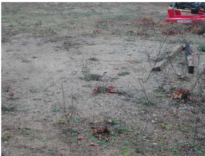
Figure 2. Location of mower while being repaired

The victim was working on a Bush Hog Brand Rotary Cutter Model 3210. According to the manufacturer's literature found on the Internet, the rotary cutter had a 10 1/2-foot cutting width and weighed 2,741 pounds. The Ford tractor he used to lift the mower was equipped with a 7600 Bush Hog Brand front-end loader/bucket. A few days prior to the incident, when using the tractor and mower, the mower ran over some fence wire. The wire became entangled in the mower blades and the victim parked the mower in a field. The ground where he left the mower was covered by a layer of what appeared to be fine mortar sand.