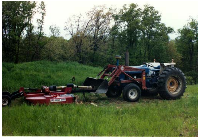
Figure 1. Incident Scene

On May 26, 2003 a 56-year-old horse farm owner was killed when he was crushed under a Bush Hog Brand Rotary Cutter Model 3210 rotary mower while changing the cutting blades. A few days before, he had cut a field and noticed that there was a problem with the mower. He left the mower at a location other than the utility barn. The floor in the utility barn was a concrete pad and the ground where he left the mower had what appeared to be dry mortar sand on its surface. (See Figure 1)