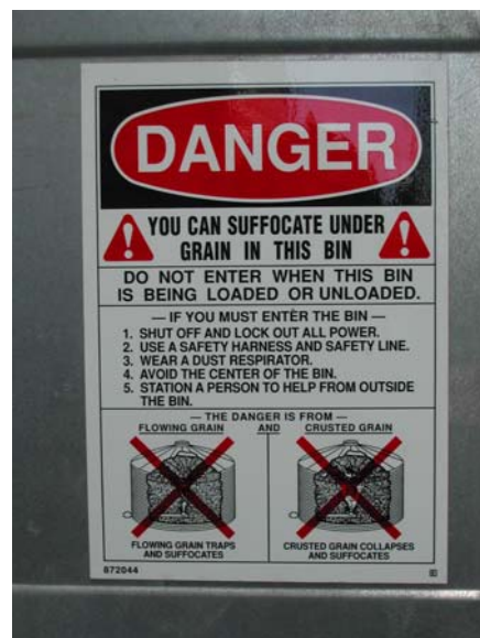
Figure 3. Confined Space warning sign on bin door

The deceased and his brother had bought the new storage system, including the Chief bins, two years prior to the incident. The summer of the deceased's death was the first time the bin had been emptied. Shelled corn was dried in a dryer to approximately 160-degrees and was dropped hot into cooling bins that are 36 feet in diameter and hold about 18,000 bushels of corn. The corn slowly cools in these bins and when the corn reaches the approximately 40-50 degrees, it is moved to the Chief bins for bulk storage. When the nights are cool, the deceased would turn on the Chief bin fans to provide floor aeration to assist in further cooling of the corn. The corn is stored at 14% air moisture content.