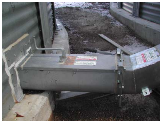
Figure 1. Auger unloading system

The Chief bin was equipped with a power sweep