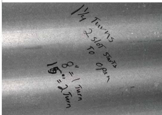
Figure 2. Auger unloading instructions on grain bin wall