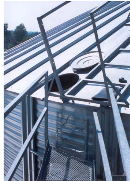
Figure 4. Open entry hatch at top of grain bin

The brother mowing the lawn checked on the victim at approximately 11:00 am because a neighbor, who was supposed to meet with the victim, couldn't find him. The neighbor and brother searched the farm and also looked through the open hatch at the top of the bin to see if they could find the deceased (See Figure 4). When his brother, saw that the victim's truck was at the farm and his cell phone in the farm office, thought that the victim had hurt himself in the bin. The brother told the victim's mother to call for emergency response. Both the victim and neighbor separately entered the storage bin looking for the victim and calling his name. He and the neighbor began to cut open a hole on the southeast side of the bin when paramedics arrived.