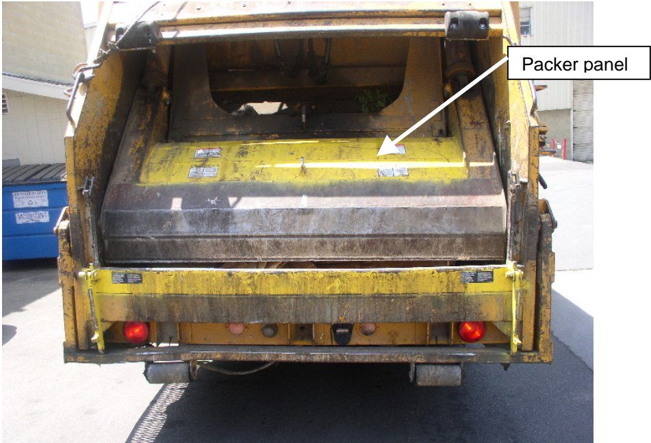
Exhibit #4. A picture of a rear loading trash truck, similar to the one involved in the incident, with the packer panel in the position when it struck the victim who was reaching into the hopper.