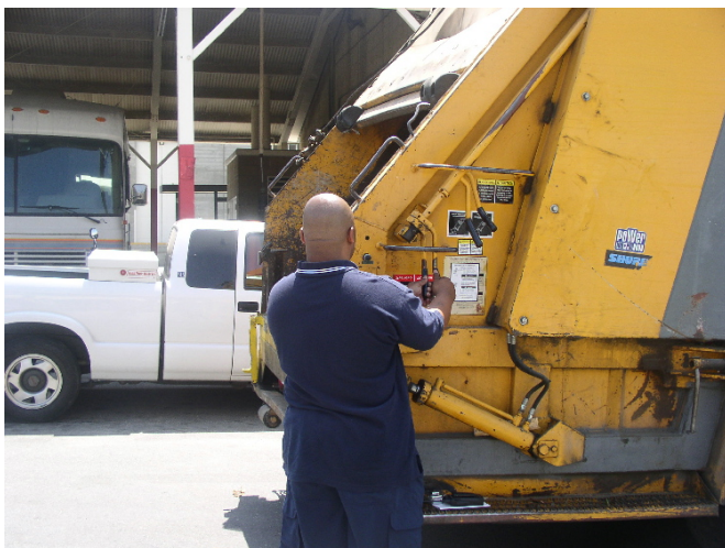
Exhibit 2. A simulation of an operator at the controls of the trash truck operating the packer panel.

On the day of the incident the victim and co-worker were picking up old furniture in an alley behind a row of apartments off one of the main streets in the city. The trash truck had to be