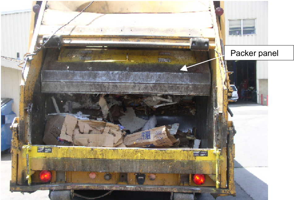
Exhibit #3. A picture of a rear loading trash truck, similar to the one involved in the incident, with the packer panel at the beginning of its cycle.