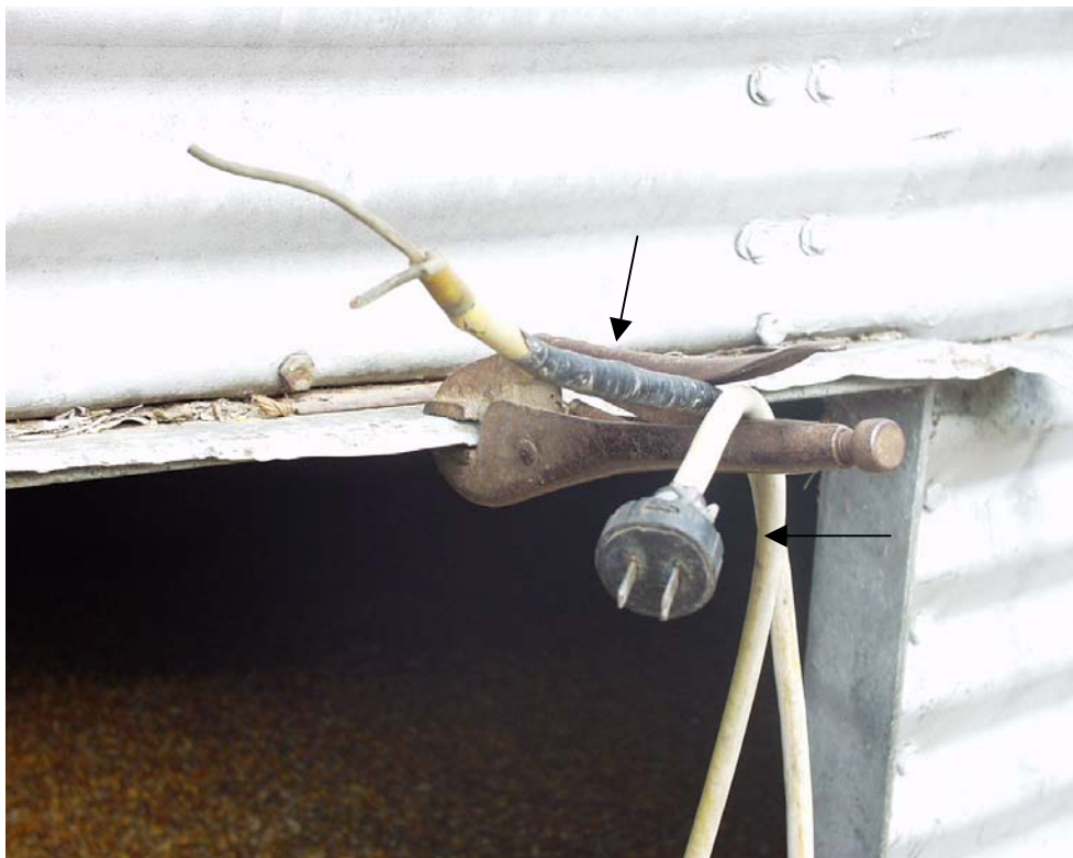
Picture #6. Portable auger motor cord with tape and two-prong male end.