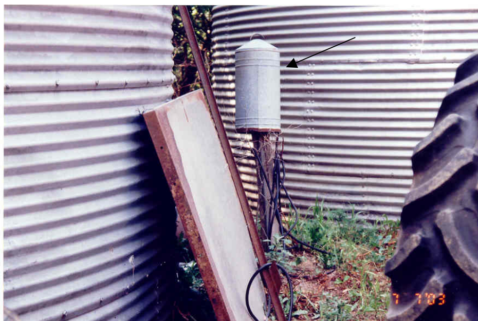
Picture #8. Pull box between bins day of incident with protective covering.