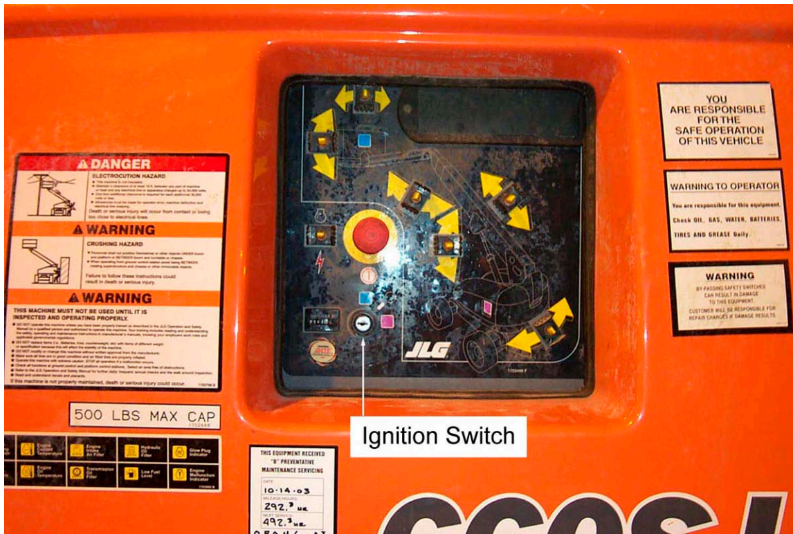
Figure 4. Ground Control Panel - Taken Immediately Following Incident Illustrating Missing Key