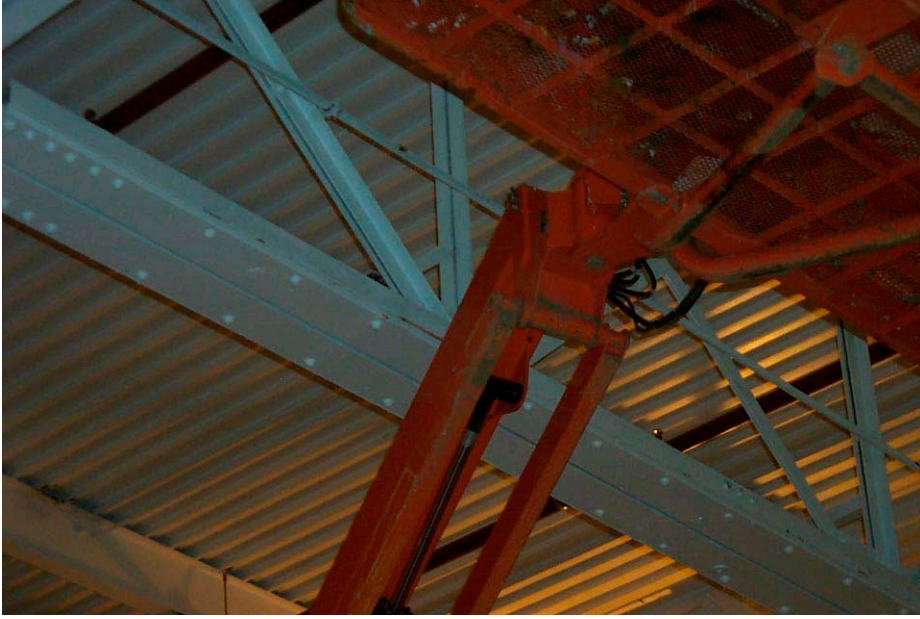
Figure 5. Simulation of Arm at Truss