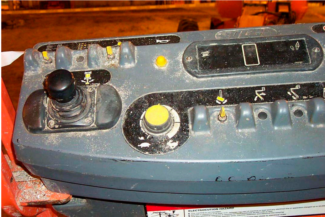
Figure 3. Basket Control Panel