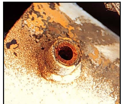
Photo 3 -- Hydraulic line input showing broken edge of nipple. Photo taken several months later shows significant additional rusting.