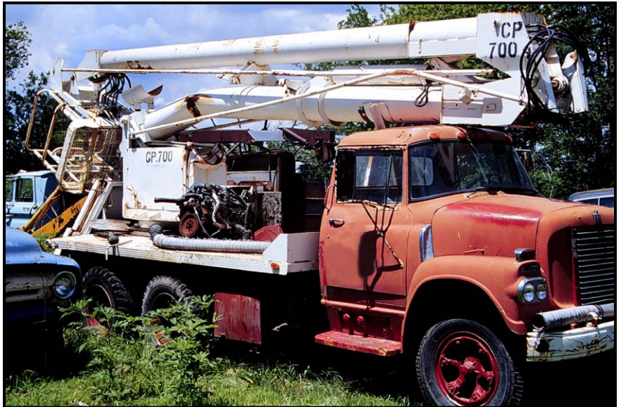
Photo 1 -- View of boom truck as it sits in a junkyard. The bend in the lift arm occurred when the machine fell to the ground.

During February 1999, a 62-year-old self-employed tree trimmer died after falling 35 feet from the bucket of a boom truck and landing on the frozen ground. The 2-piece hydraulic lift arm was in an extended vertical position when a hydraulic safety valve on the main hydraulic cylinder snapped off, causing the lift arm to collapse and the bucket to immediately fall to the ground. The victim rode with the bucket and was thrown out of the bucket after it hit the ground. The man died shortly thereafter from hepatic rupture and internal bleeding.