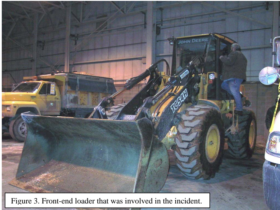
Figure 3. Front-end loader that was involved in the incident.

operator's blind spot on the left side extended back from the left rear of the vehicle approximately nine feet.