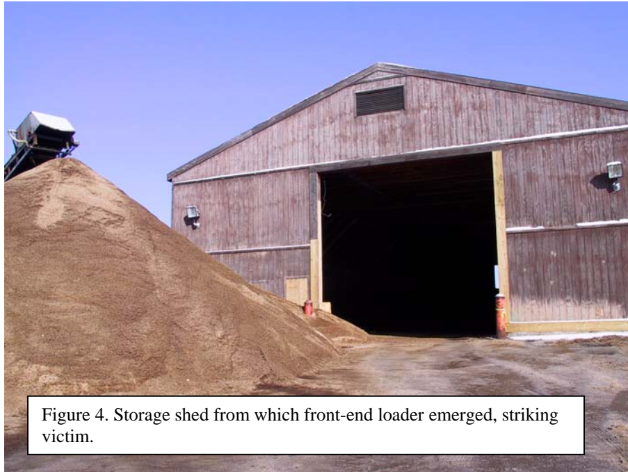
Figure 4. Storage shed from which front-end loader emerged, striking victim.

standing between the two salt piles. Operator A asked the victim to set the conveyer out-feed end further away from the shed entrance in the future so the treated salt would not obstruct the path of the loaders. After talking to the victim, Operator A watched the victim walk toward the conveyer. Operator A then started his loader to continue transporting the salt. According to the operator's estimation, he did three more runs before the incident occurred.