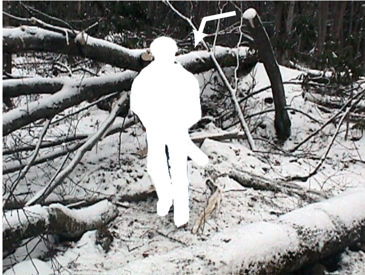
Figure 3. The photo shows the victim's position when struck-by the birch.