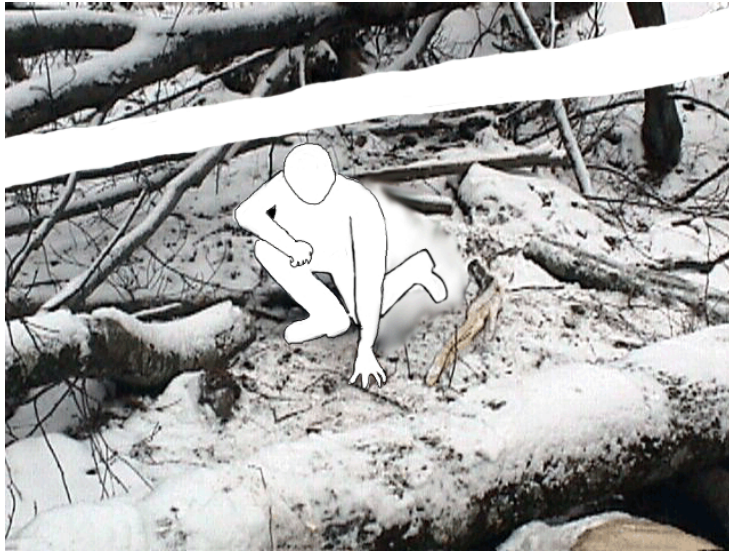
Figure 5. The photo shows the victim's position when struck-by the birch.