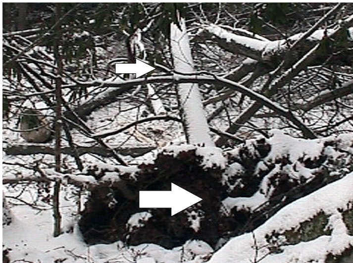
Figure 4. The photo shows the weak root system and the associated root wad of the tree which was pulled over onto the victim due to entanglement. From this perspective, the victim would have had been viewed from behind and located approximately 12 feet from the root wad. The arrow in the background indicates his approximate position