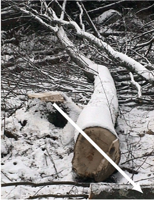
Figure 1. The photo shows the butt of the felled tree. Note the degree of back lean. The arrow represents the intended direction of the fell from the stump.