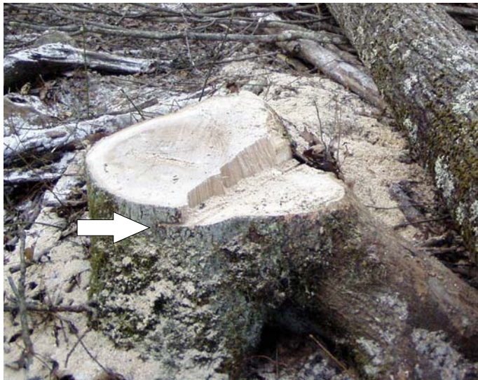
Figure 2. The photo shows the tree's stump. The white arrow points to the bypass cut on the bottom of the face notch. The bypass completely eliminated any hinge wood.