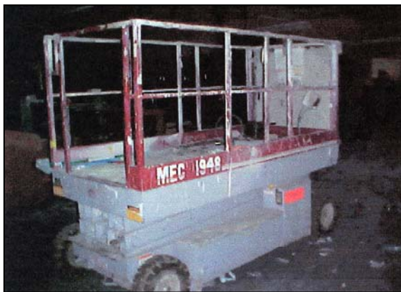
Photo 2 Scissor Lift

The incident occurred on the afternoon of Wednesday, May 5, 2004. The two-man crew started work on the project, which was expected to take two to three days to complete. The crew began in the morning during their usual 7:00 a.m. to 4:00 p.m. shift. They used a powered scissor-lift to raise them up the wall and to the ceiling joists of the thermoforming room. Work proceeded uneventfully through the morning and into the early afternoon. At approximately 3:00 p.m., the two workers were on the lift, installing conduit near the end of the electrical bus bar. The end of the bus enclosure was open due to a missing end-cap, exposing the four electrical conducting plates. While the mechanic had his back turned, the victim picked up a voltmeter that was kept in the lift for use by the electrical contractors. The victim, who was not trained to test circuits, connected the two testing probes across the copper plates. The mechanic reportedly saw this and shouted “No!,” but the connection caused an electrical arc and overloaded the voltmeter, which exploded near the victim.