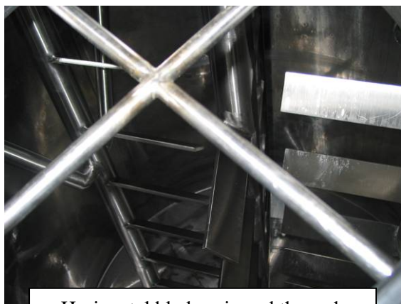
Horizontal blades viewed through newly-installed bars across hatch

approximately 500 gallons of product. The tank was 76 inches in diameter with an 88-inch-deep straight wall, a domed top, and a bottom with a slope of approximately 15 degrees. The access opening on the top of the tank was 19 inches in diameter, and was fitted with a hinged hatch. The height from the platform to the tank opening was approximately 36 inches. The only entrance or exit from the tank was the access opening at the top; there was no ladder, door, or hatch at the bottom.