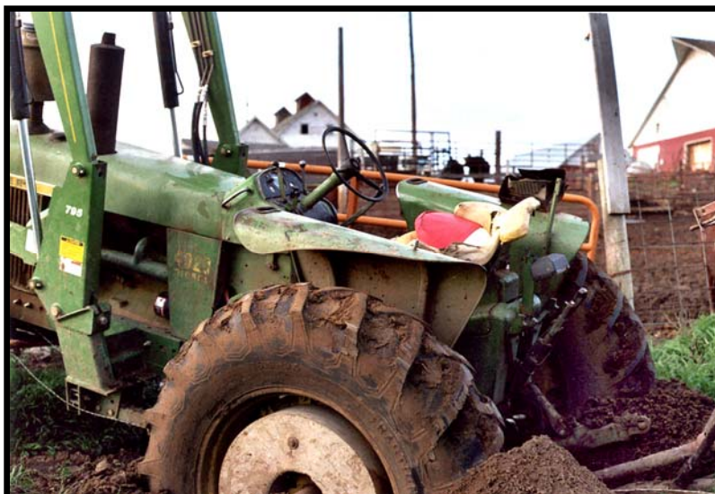
Photo 2 – Close-up of the tractor showing the rear wheels dug in, and also the smashed radio and damaged seat.

The farmer's wife arrived home from work after 5:00 PM and began to prepare supper. Hearing the tractor noise and seeing cattle loose on the farm, she assumed some animals had wandered off and that her husband was rounding them up.