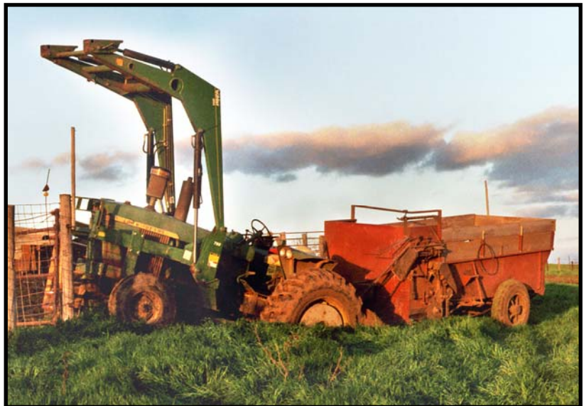
Photo 1 – Tractor and feed wagon where they were found (not where incident occurred) with loader still raised and tractor wheels dug deeply into the ground.

During the spring of 2005, a 45-year-old farmer was killed while feeding cattle on his farm. The man was driving a tractor equipped with a front-end loader that had a bucket attached to its lift arms. He was towing a single-axle feed cart behind the tractor and had finished filling several feeders in the cattle yard. On his way out of the cattle yard, he steered his tractor uphill on the incline back toward the gate. It was slippery due to recent rains. The tractor was losing traction. The victim moved from the operator station to stand on the hitch and raised the loader, presumably for added traction. Moving from the tractor seat to the drawbar of the moving tractor was something others had seen the man do before.