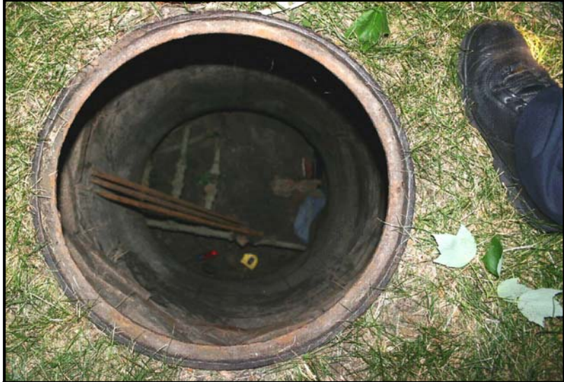
Photo 2 – Shutoff valves at bottom of manhole vault controlled the supply of water to adjacent homes. Tools for operating them lean across the entry way.

Approximately 175 mm (7 in) up from the sand floor, midway up in the flared-out bottom zone, a 25 mm (1 in) diameter water line ran horizontally, a little off of center, across the pit (Photo 2). Connected to this supply line were three water lines, one for each house served on that side of the street. Each water line had an inline shutoff valve. The private company supplying water for the city did not own nor did they lease this service manhole from the property owners. Hand tools (rods with tools attached to their ends) to operate the shutoff valves without entering the manhole were propped within reach against the side of the cylindrical shaft.