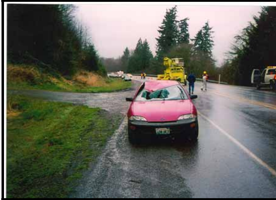
Photo 4: Shows the vehicle involved in the incident looking west along the shoulder of the eastbound lane.