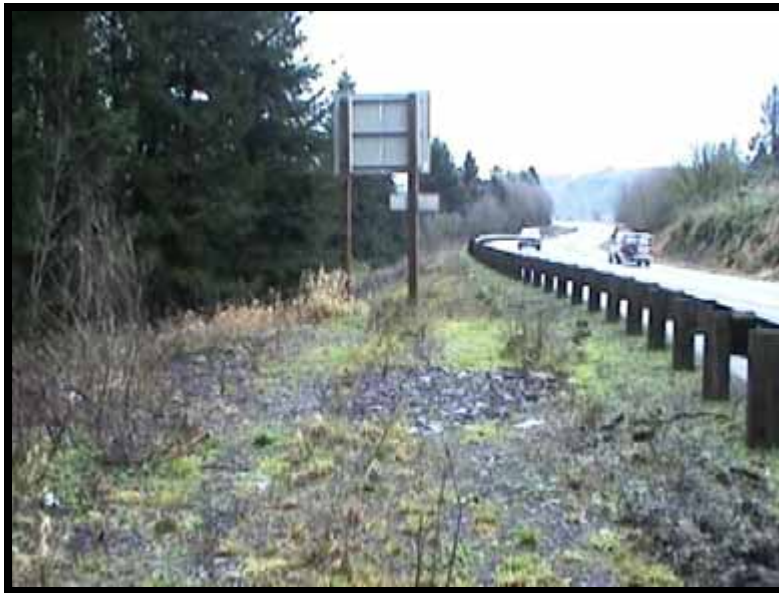
Photo 6: AFTER - Shows the work zone site during 2 nd post-incident FACE investigation site visit, and after fill, rock & gravel had been brought in so sign installation could be completed off the roadway without impacting highway traffic. This view is looking east along the westbound lane of highway.