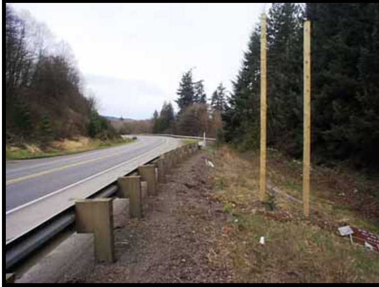
Photo 5: BEFORE - Shows the work zone site during 1 st post-incident FACE investigation site visit, prior to fill, rock and gravel being brought in to augment the sign installation. Looking west along the eastbound lane of highway.