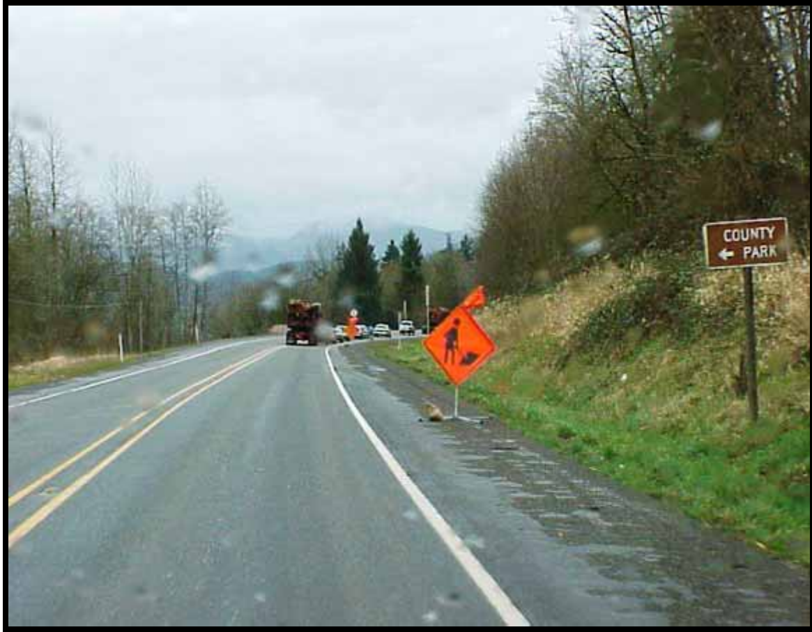
Photo 1: Shows work zone signs traveling eastbound heading toward the incident site which is just beyond the curve on the highway.