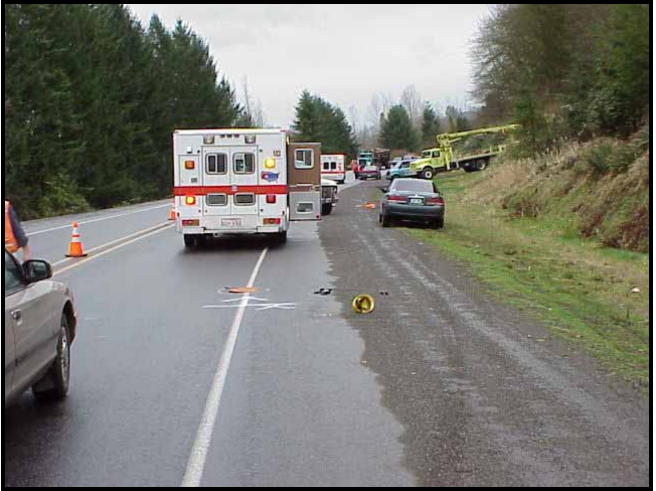
Photo 3: Shows the incident site looking east on the eastbound traffic lane and the shoulder of the highway.