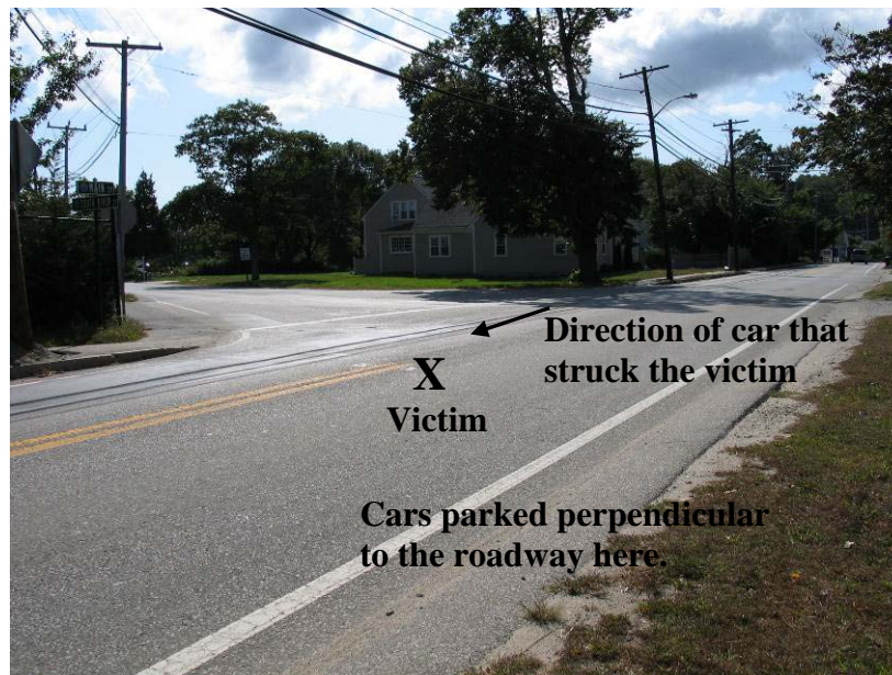
Figure 3 – Property adjacent to the intersection where cars were parked perpendicular to the main roadway. The location of the car in the photograph is how close the cars were to the roadway and were parked all the way across the front lawn of the house.