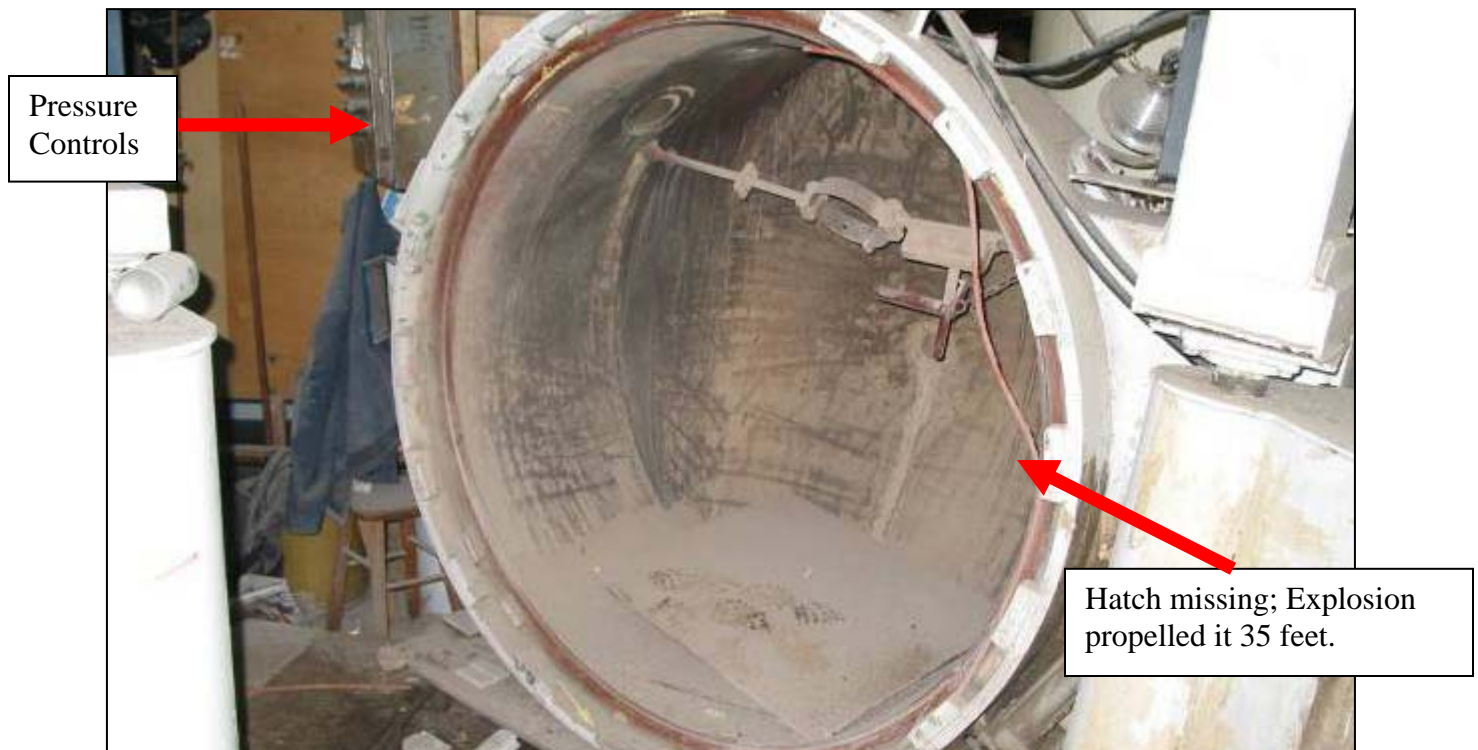
Figure 3. Broken Hatch