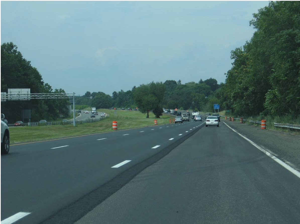
Figure 1 – Roadway where incident occurred.