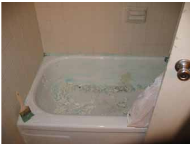
Figure 1. Incident bathtub, brush used to spread product and location and swing of bathroom door

In the winter of 2010, a 52-year-old male tub re-glazer died due to overexposure to methylene chloride (MC) vapor while stripping a bathtub in an apartment bathroom using Tal-Strip® II Aircraft Coating Remover (Tal-Strip® II). Methylene chloride was the primary ingredient of the aircraft-grade Tal-Strip® II (60%-100%). The work process involved pouring Tal-Strip® II directly from the container onto the tub surface and using a 4-inch paintbrush to spread the product. At approximately 9:30 a.m., the decedent arrived at the apartment complex. At approximately 11:10 a.m., one of the apartment maintenance personnel attempted to contact the