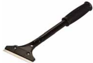
Figure 9. Example of long-handled scraper

As an example, refinishers should purchase/modify the paintbrush (if used) and scraper. The decedent’s work practice was to utilize a 4-inch paintbrush with a standard-sized handle (Figure 1). Employers/workers should consider adding an extender to the tool or purchase tools with longer 12-inch handles to minimize the worker’s exposure by reducing the bending/leaning into the tub. An example tool is shown in Figure 9