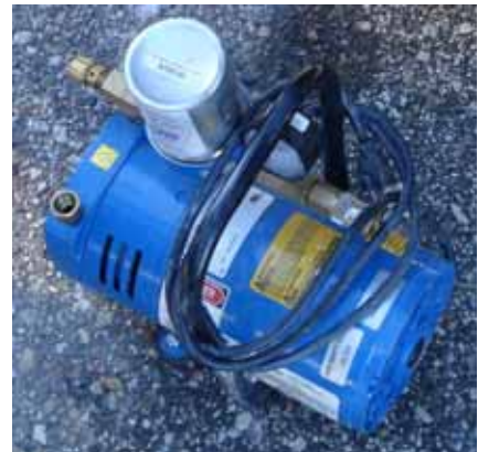
Figure 4. Air pump that supplied breathing air to the supplied air respirator system