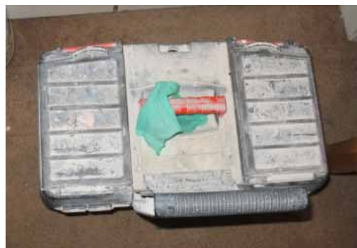
Figure 7. Type of glove worn by decedent