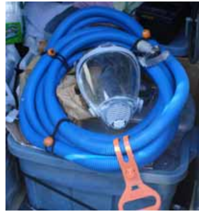
Figure 3. Full-face air supplied respirator