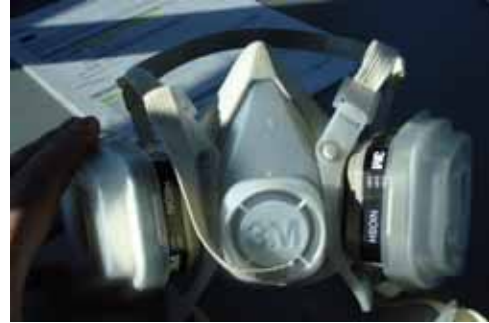
Figure 2. Air purifying, half-face piece respirator with cartridges

Figures 2-4 show the respirators and associated equipment owned by the owner MIFACE spoke with during the on-site interview. Both full-face, supplied air respirators (SARs) and half-mask respirators equipped with organic vapor cartridges were purchased and, the owner noted, should have been available for use depending upon the job parameters.